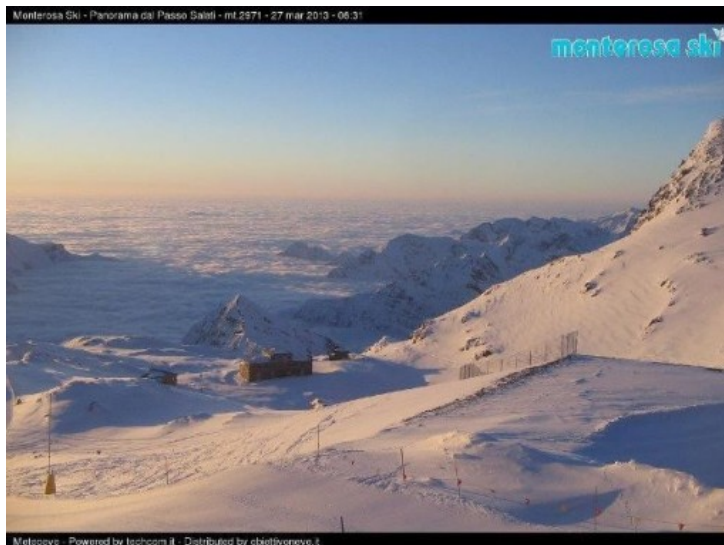
Great snow conditions in the Monterosa region – at least higher up.

Most Italian resorts have seen a little fresh snow in the last few days, but the best conditions are in the higher resorts such as Cervinia (40/290cm) and Passo Tonale (90/400cm). Lower down, snow cover is still good for late March in Sauze d'Oulx (100/140cm), but slush is (inevitably) an issue as the day progresses.