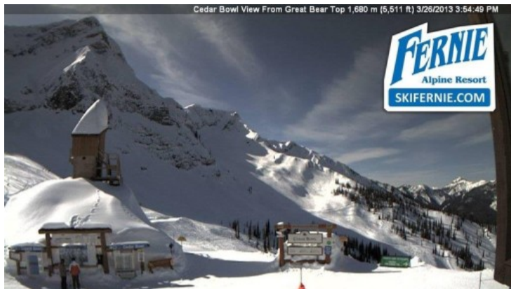
It has turned quite mild in Western Canada but there is still masses of snow in Fernie

Snow conditions remain good at altitude in Whistler (258cm mid-mountain) but milder weather does mean increasingly slushy slopes lower down. The same is true further inland for Fernie (310cm mid-mountain) despite the huge snowfalls that it received last week. For the best snow quality, stay high.