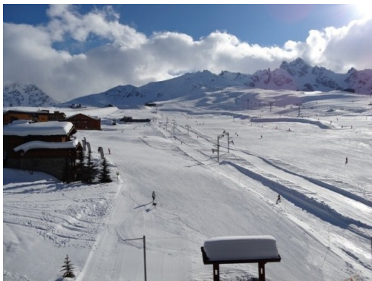
The snow has remained excellent above 1800-2000m in Courchevel this week.