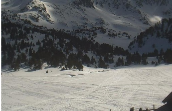
Snow cover is still highly impressive in the Pyrenees. This is Grau Roig near Soldeu in Andorra.

Conditions in the Pyrenees remain excellent for the time of year with a dusting of fresh snow in Soldeu , Andorra (150/220cm). In Bulgaria, Bansko (30/150cm) has also seen a little new snow, though conditions are variable with plenty of slush lower down. Better news for Sweden's premier resort – Åre (65/110cm) where lower temperatures mean more consistent snow conditions.