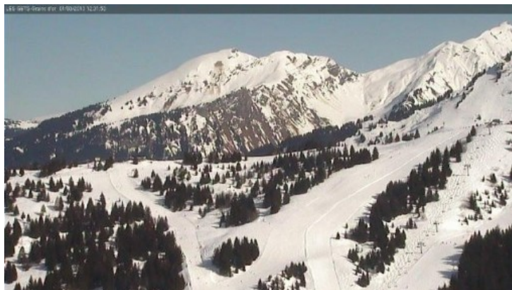
Plenty of snow, plenty of sun in Les Gets today

There's been no recent snow for Morzine (65/290cm) or Megève (90/170cm), but here too snow cover remains excellent for the time of year - just watch out for a little slush at lower elevations in the strong afternoon sun.