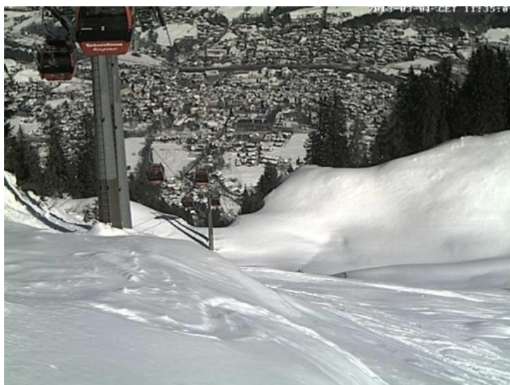
Good snow cover all the way down to resort still in Kitzbühel

Conditions remain excellent right across Austria but with lots of sunshine over the next few days, expect spring conditions on some lower and/or south-facing slopes. No such issues yet for high altitude Obergurgl (110/255cm) where the snow remains crisp at all levels. Conditions are also excellent in Kitzbühel (75/165cm), but here the snow is likely to soften up in the afternoons - at least lower down.