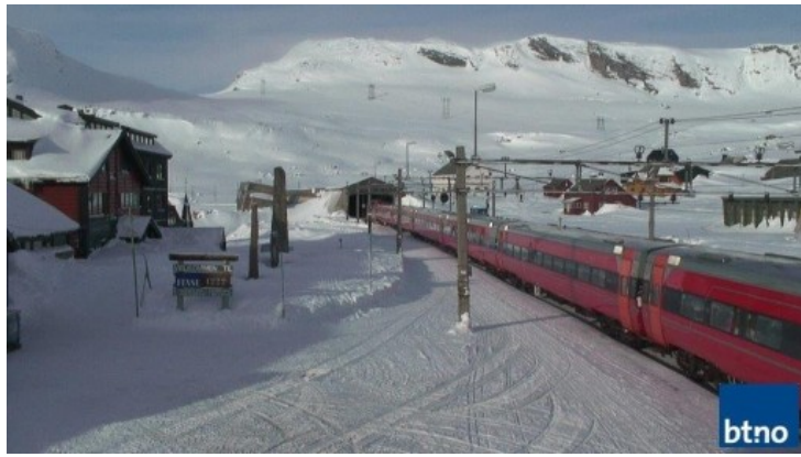
Plenty of snow in Norway as you would expect. This is Finse.