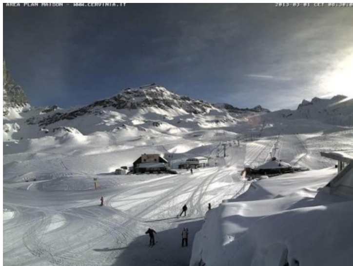
Bluebird day in Cervinia

Snow conditions remain very good in most Italian resorts, particularly the south-west where there has been recent snowfall. Sestriere (70/150cm) had at least 40cm mid-week and is skiing superbly at all levels. Further east, the Dolomite resort of Selva (70/160cm) saw a significant fall earlier in the week and is also in good shape though some south-facing runs are turning soft in the strong afternoon sun.