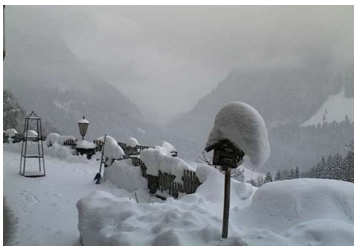
Huge amounts of snow in Austria's Vorarlberg (far west) - Photo: www.kanisfluh.net

It is snowing today in the north-western Austrian Alps – 15cm so far in Lech (150/300cm) where conditions are just about perfect. Further east, Obertauern (210/250cm) is also in great shape – as are lower altitude resorts such as Söll (90/160cm) thanks to the continuing cold.