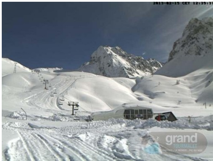
Masses of snow in the Pyrenees right now. This is La Mongie in the Grand Tourmalet area (France) - Photo: www.grand-tourmalet.com