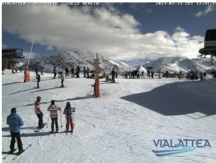
Bright and crisp in the Italian Milky Way. This is Sestriere - Photo: www.vialattea.it