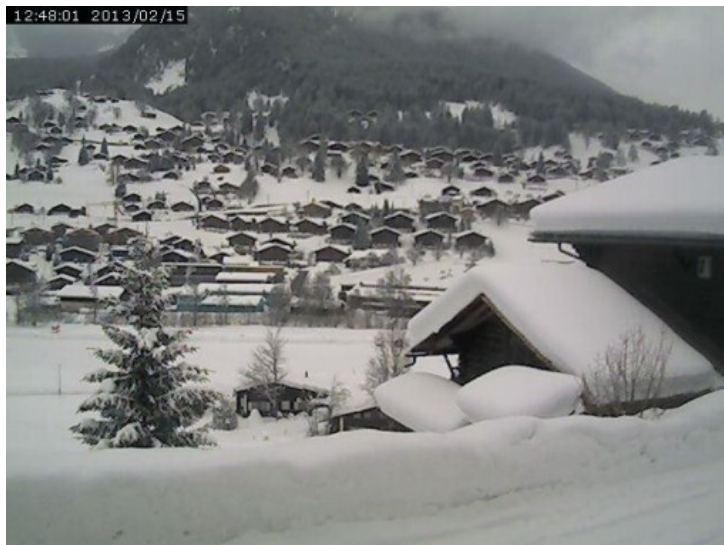
Fresh snow today for Grindelwald

There is fresh snow across most of Switzerland and conditions are superb just about everywhere. Engelberg (110/540cm) claims the deepest base in the Alps with soft powdery snow from top to bottom. Andermatt (130/430cm) is not far behind. Lower resorts such as Villars (65/230cm) and Wengen (75/180cm) are also in perfect shape in the run up to one of the busiest weeks of the season.