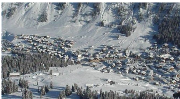
Lech is having an excellent season even by its super-snowy standards

There have been further snow flurries in Austria today where conditions remain excellent at all levels. High altitude Obertauern (215/250cm) has particularly impressive snow depths, but the cold weather is also allowing lower lying resorts such as Kitzbühel (75/170cm) to hold their own.