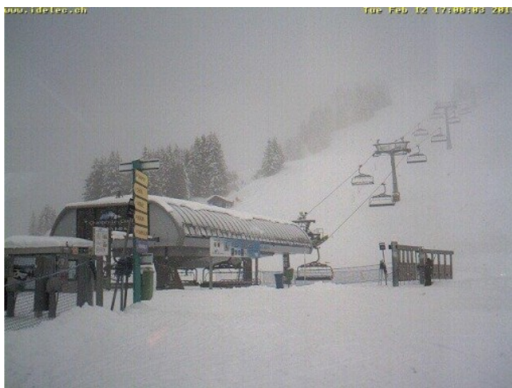
Further snowfall today in Champéry in the Swiss Portes du Soleil

Plenty of fresh snow has been falling across Switzerland this week, particularly in the northern Alps where Villars (60/230cm) reports powder at all levels. On the other side of the country, St Moritz (35/173cm) has missed out on the heaviest snow, but on-piste at least conditions are still excellent.