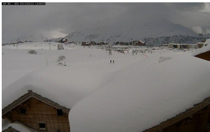
Alpe d'Huez has seen some of the biggest snowfalls in France this week

Fabulous conditions continue across the French Alps with further snowfalls today (Tuesday). Alpe d'Huez (220/380cm) is doing particularly well this week with a further 30cm of fresh snow in the last 24hrs. Further north, La Clusaz (90/360cm) reports 40cm of new snow and offers perfect powdery snow right down to resort level.