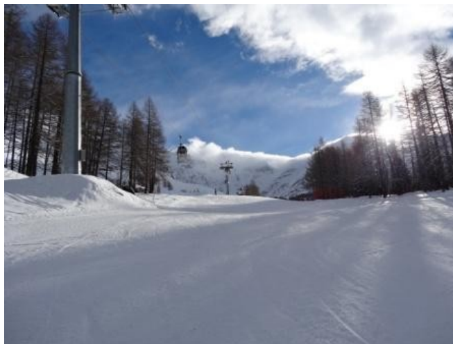
Great snow today in Madesimo