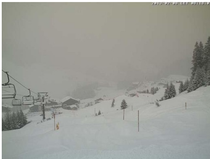
Snowing again today in Warth-Schröcken

Most Austrian resorts have fresh snow and conditions are excellent at all levels. The deepest powder is in the far west (Vorarlberg) where super-snowy Warth-Schröcken has 250cm at resort level and 335cm up top. Further east, the slopes are also in great shape with 80/150cm in Westendorf and 90/190cm in Saalbach . It's freezing cold though and temperatures are expected to stay low for the foreseeable future with further snow flurries from time to time.