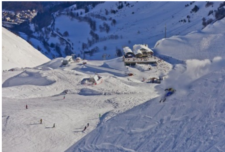
Super-snowy Cauterets earlier this week

The Pyrenees have seen some extraordinary snowfalls in recent weeks and it is still dumping in Cauterets where we suspect depths have now surpassed 6m up top! (It's been so snowy that information has been difficult to access). Whatever the case, this is the deepest base in the world and the first time (that we can remember) that snowfall figures in the Pyrenees have reached anywhere near that level.