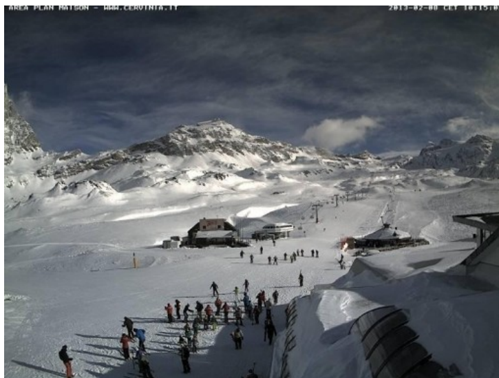
Sunshine in Cervinia today but it's bitterly cold

There has also been a little snow in Madonna di Campiglio (60/150cm), but whilst the pistes remain excellent, Italian resorts have not had the deep powder that we have seen further north. Their turn should come early next week, however, with a spell of heavy snow for the southern (and particularly south-western) Alps expected on Sunday night/Monday.