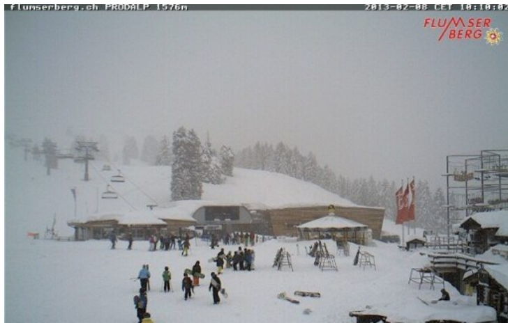
Still snowing in the north-eastern Swiss Alps. This is Flumserberg