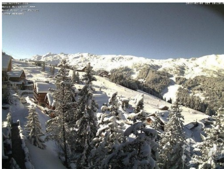
Perfect conditions in Méribel