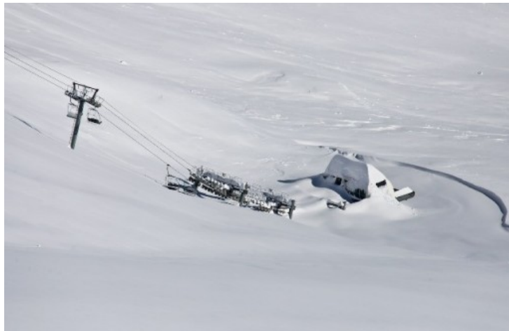
Record-breaking snow depths in the western Pyrenees. This is Cauterets

The Pyrenees have seen some extraordinary snowfalls in recent weeks and it's dumping it again in Cauterets today where snow depths are 5.5m up top, the highest of any ski resort in the world! By contrast, it's been fairly dry in Bulgaria recently but conditions are still good in Borovets (110/160cm) and snowfalls are expected to resume on Thursday. Good conditions are also reported in Norway where Geilo has a dusting of snow and the base is 71/89cm deep depending on altitude.