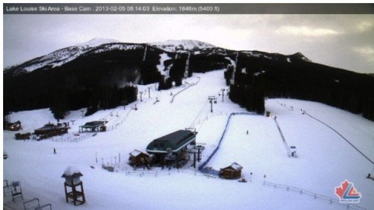
Great conditions continue in western Canada. This is Lake Louise - Photo: www.skilouise.com

After a few days off it's snowing again in Whistler where there is 20-30cm of powder at altitude and the mid-mountain base is 189cm deep. Flurries have also spread inland to Kicking Horse (140cm upper base) where conditions are excellent top to bottom.