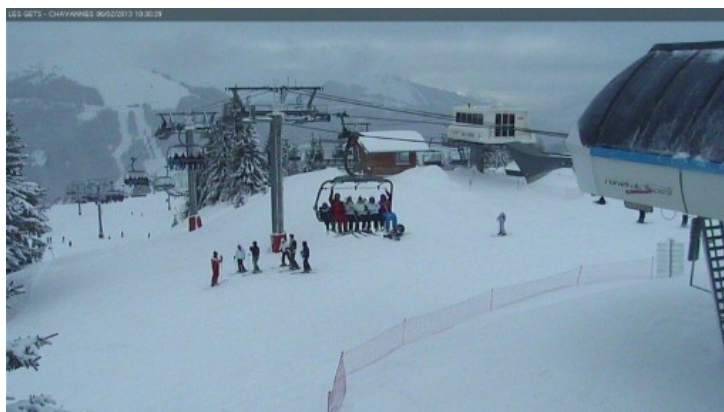
It just can't seem to stop snowing in the Portes du Soleil. This is Les Gets - Photo: www.lesgets.com