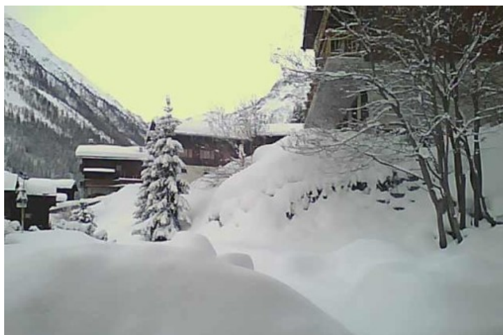
Powder day in Grimentz - Photo: www.64urssteiner.net

Conditions are superb throughout Switzerland with lots of fresh snow, particularly in the north and west. It's yet another powder day in Verbier (115/290cm) which continues to enjoy one of its best ever seasons. The snow is even deeper in Andermatt (120/420cm) and Engelberg (105/470cm) that boast the two deepest upper bases in the Alps.