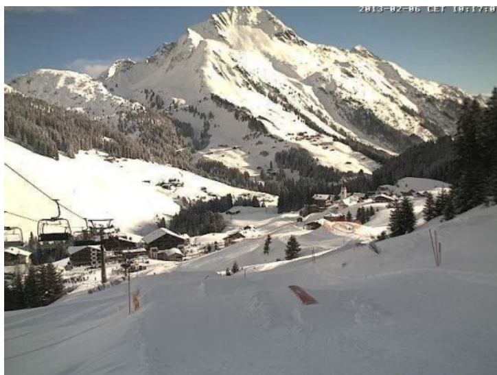
Deep snow and blue skies first thing this morning in Warth

Most Austrian resorts saw a big dump of snow on Monday (up to 50cm in places) and, with colder air now in place, conditions are excellent across the board. In the west, Lech (160/300cm) is living up to its super-snowy reputation with an additional 20cm overnight. Further east, lower resorts such as Kitzbühel (80/175cm) are also in perfect shape, and it is set to remain cold for the foreseeable future.