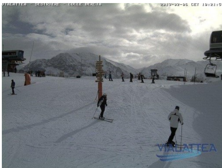
Perfect pistes in Sestriere - Photo: www.vialattea.it

Conditions in Italy remain very good just about everywhere, despite most Italian resorts having missed the heaviest of the recent snow. One exception is the Aosta Valley, where it snowed last night and conditions in Courmayeur (80/185cm) are excellent at all levels. There has been no significant fresh snow further east in Madonna di Campiglio (60/150cm), but all lifts are open today and here too the slopes are in great shape.