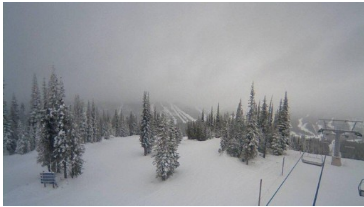
Good conditions continue in western Canada. This is Sun Peaks

Next full snow report on Wednesday 6 February, but see Today in the Alps for daily updates