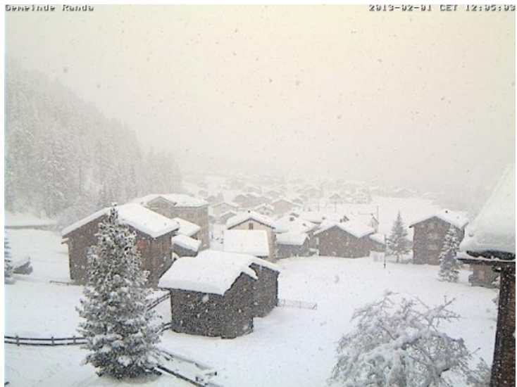
Heavy snow at Randa near Zermatt today.