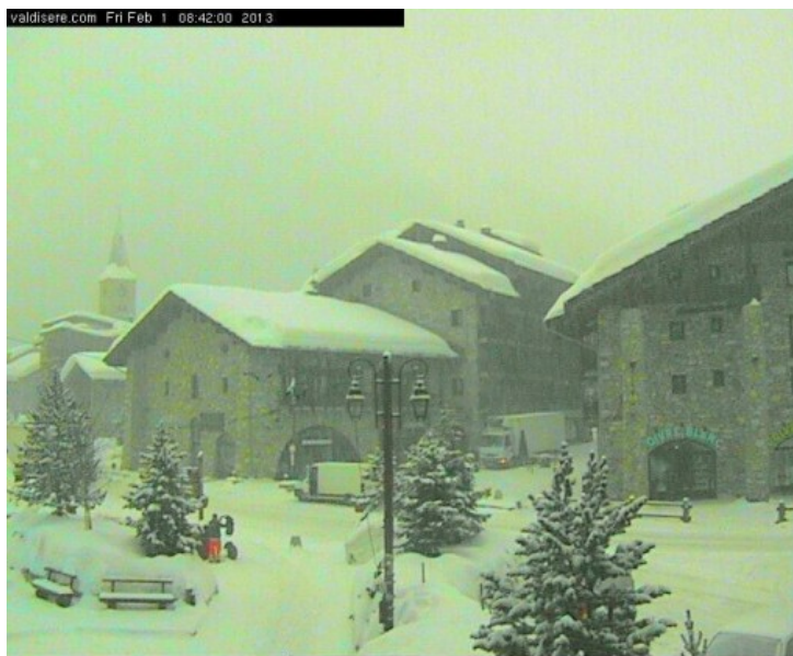
Snowing in Val d'Isère this morning