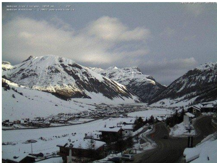
Drier on the south-eastern side of the Alps today. This is Livigno

A drop in temperature is expected in all Italian resorts tomorrow (Saturday) with fresh snow in many places.