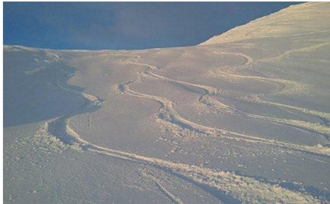
Fresh tracks in Åre (Sweden) this week

It's also been mild in the Pyrenees, but snow depths are still impressive in Andorra's Arcalis (200/270cm) with heavy snow expected to return tonight. In Bulgaria, Bansko (80/180cm) is skiing well at all levels and it's also good news for Sweden's Åre (40/75cm) where 10-15cm of snow has fallen over the last few days.