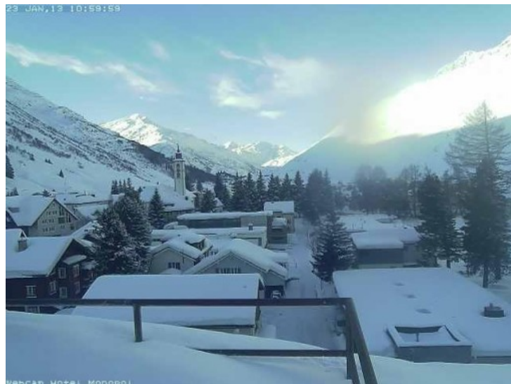
A very snowy looking Andermatt where the upper snow depths are the greatest in the Alps

Andermatt (88/400cm) has received top-ups throughout January and now boasts the highest upper base in the Alps. Further north, Engelberg is not far behind with 80cm in the village and 375cm up top on the glacier. Snowfall figures are more modest in St Moritz (35/125cm) in the far south-east of the country, but here too there has been fresh snow in recent days and conditions are excellent at all levels.