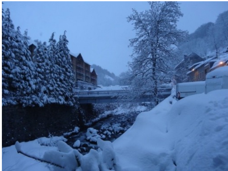
Excellent snow cover in the Pyrenees. This is Barèges - Photo: weathertoski.co.uk