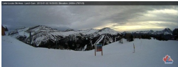
Western Canada's excellent season continues. This is Lake Louise

It has been dry for some time in western Canada but conditions remain excellent and snow is on its way over the next couple days. Whistler has 178cm mid-mountain and is in great shape at all levels as are Big White and Fernie further inland, which both report 182cm.