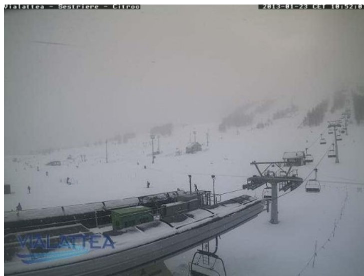
Snowing today in the south-western Alps. This is Sestriere, Italy

Conditions are good in most Italian resorts, including Sestriere (60/120cm) where it is snowing this morning and further snowfalls are likely through the day. Conditions are also excellent in Courmayeur (80/170cm) where it was bright first thing this morning, but here too a few flurries are likely later on. Further east it should remain dry today in Cortina (40/150cm), where they have seen lots of snow over the last few days and excellent skiing is reported at all levels.