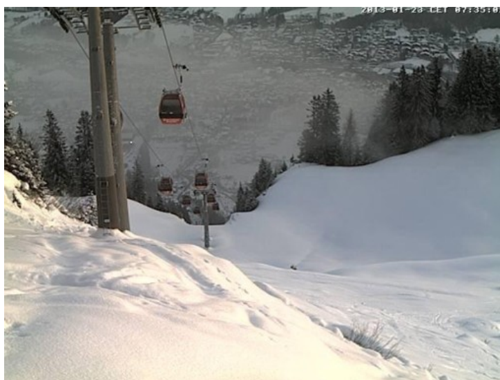
Even the lowest resorts are in great shape. This is Kitzbühel

Most Austrian resorts have seen new snow in the last few days and, with the low temperatures, conditions are excellent at all levels. High altitude Obergurgl (95/215cm) and Obertauern (180/225) are skiing as well as anywhere in Austria, but lower resorts such as Ellmau (55/235cm) are also in great shape.