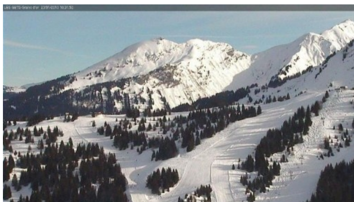
Excellent snow cover at all levels in the French Alps. This is Les Gets - Photo: www.lesgets.com

Conditions are excellent right across the French Alps. In the north, Avoriaz (230/270cm) saw fresh snow on Monday and boasts the highest resort level base in the country. Nearby Les Gets is also skiing superbly at all levels, despite its lower altitude, with 85cm at village level and 200cm up top – well above par even for the middle of January. Further south, Isola 2000 (160/230cm) continues its excellent season with further heavy snow expected today (Wednesday).