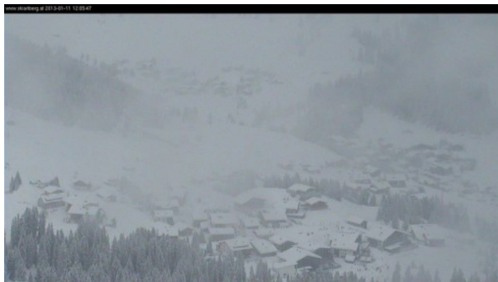
Lots of new snow in Lech this morning - less in the eastern Austrian Alps - Photo: www.ski-arlberg.at

There is lots of fresh snow in the west of the country - 35cm for Lech where the settled snow depths are 115/235cm depending on altitude. It's also snowing heavily in nearby St Anton where training for this weekend's women's downhill has had to be cancelled. Further east, many lower resorts were affected by rain last week, but conditions are improving once more in Kitzbühel (35/130cm) where some snow is also expected today.