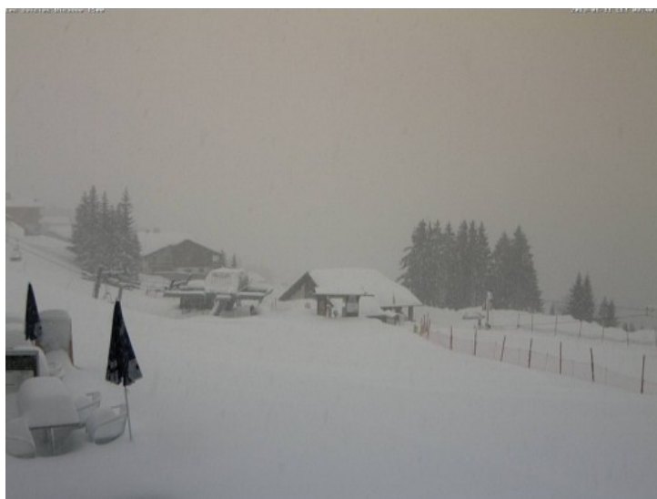
30cm of fresh for Les Saisies first thing this morning and still dumping it down

20-40cm of snow has fallen overnight in the northern French Alps where conditions are once again fabulous at all levels. It's still chucking it down this morning in Avoriaz (205/215cm) which boasts the deepest resort level snow depths in France. Further south, Alpe d'Huez (145/250cm) also has lots of fresh snow (30cm), but resorts in the far south such as Isola 2000 (105/155cm) have missed out for now.