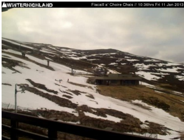
The recent thaw has left just a couple of runs open in Cairngorm, where more snow is urgently needed