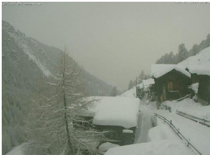
20cm of new snow in Zermatt first thing this morning

Most Swiss resorts are in excellent shape thanks to overnight snowfalls, which have been heaviest in the northern and western Alps. Zermatt (55/200cm), Verbier (75/240cm) and Wengen (50/130cm) all have about 20-40cm to play in and it's still snowing this morning. In the far south-east, however, St Moritz (35/125cm) has again missed out.