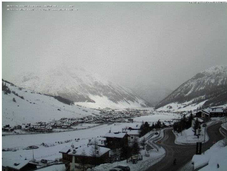
Only a dusting at best for eastern Italian resorts (including Livigno, pictured), but they are due some proper snow early next week

Resorts of the far north-west – e.g. Courmayeur (75/160cm) and Cervinia (75/235cm) have seen some overnight snow and are offering excellent skiing right now. Further east, Livigno (45/165cm) and Selva (25/80cm) haven't seen any significant snow for some time, and some lower slopes are a bit hard and icy. The good news is that decent snowfalls are expected in these parts early next week.