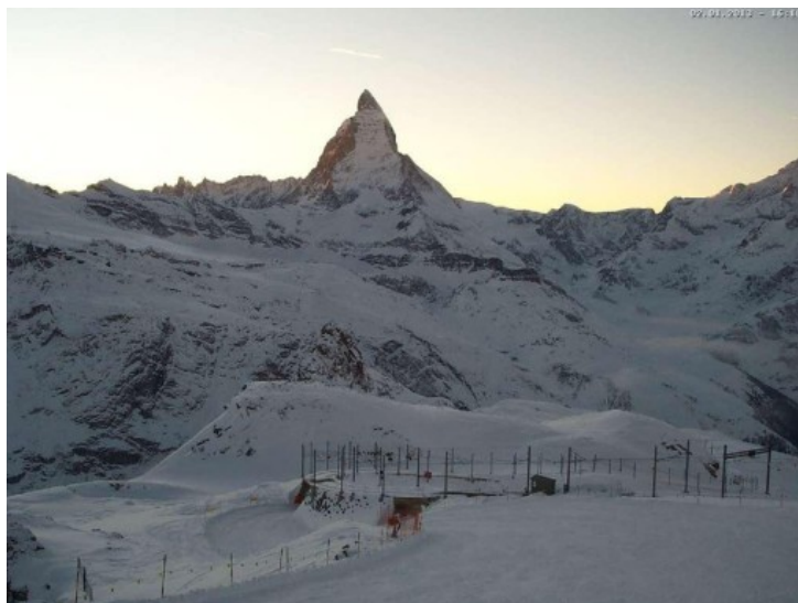
Dusk in Zermatt - www.zermatt.ch

Most Swiss resorts are still in great shape including Andermatt (70/370cm) where 5cm of fresh snow has fallen and the upper snow pack is the deepest in Europe. Verbier (80/230cm) also has new snow and continues its exceptional start to the season - as does nearby Villars (140cm mid-mountain) though here the lowest runs are a little icy. A few snow showers are possible in the north-eastern Alps on Friday and Saturday (above 1200m) but western Switzerland should stay dry and bright for some time now.