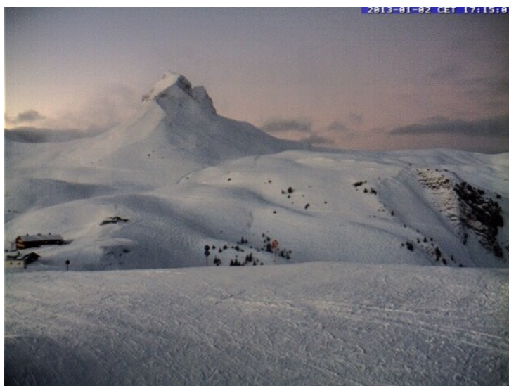
Lots of snow in the Austrian Vorarlberg. This is Damüls - www.damuels.at

The best conditions are still in the west of the country where Lech (100/200cm) and St Anton (90/165cm) both have 5cm of fresh and are skiing well at all levels. Lower resorts such as Söll (20/120cm) and Kitzbühel (40/110cm) have also seen a few cm of snow today and are in excellent shape for the time of year. Further snow showers (above 1000m) are likely on Friday and Saturday, particularly in the east.