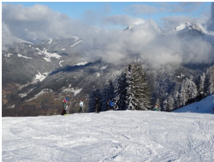
Fabulous conditions at altitude in the Portes du Soleil today - a bit icy lower down. This is St Jean d'Aulps