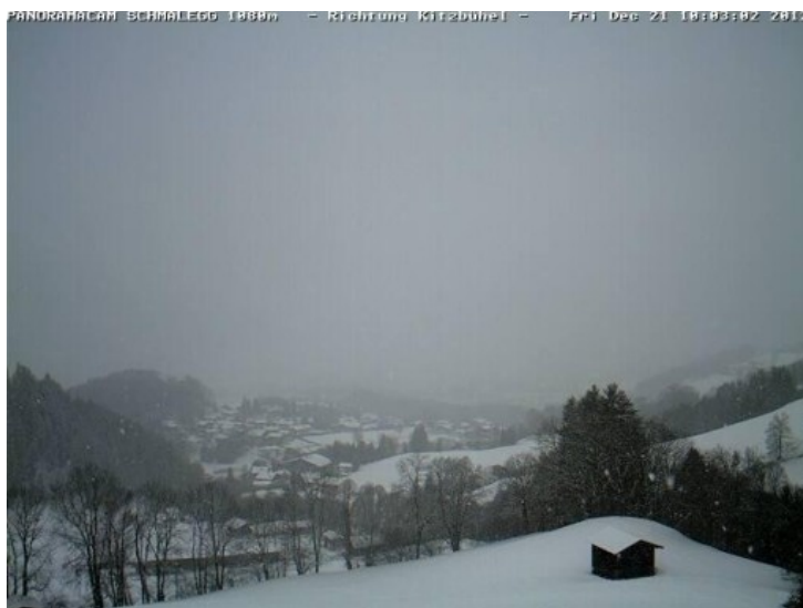
Snowing in Kitzbühel today

Conditions are also powdery in nearby St Anton (90/140cm) and Ischgl (45/110cm), the latter continuing to offer the greatest extent of connected skiing in Austria (182km). Lower resorts are also getting in on the action with fresh snow in Kitzbühel (50/95cm) and more to come today.