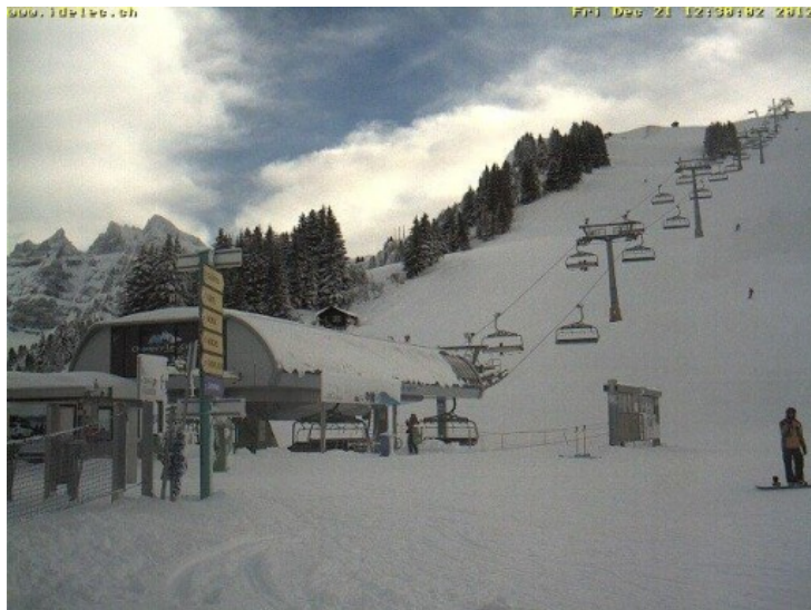
Masses of snow on the slopes above Champéry (Portes du Soleil) - www.idelec.ch