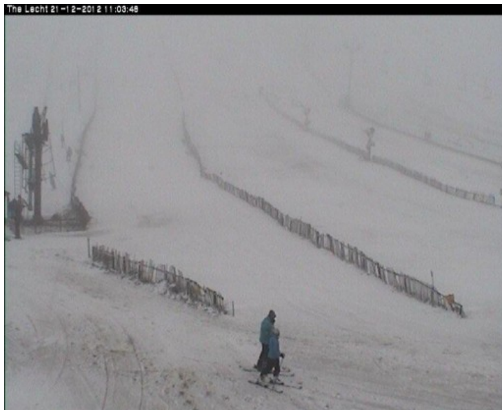
Difficult conditions in Scotland today, but prospects are good once the weather settles - www.lecht.co.uk

Skiing has also been possible in Scotland in recent days but the weather isn't great at the moment and Cairngorm is closed today due to high winds. There has been significant new snow, however, so conditions should be good once things improve.