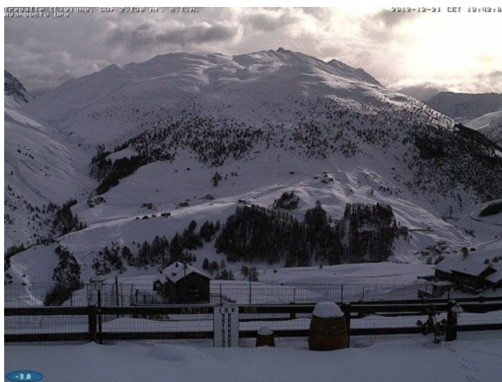
Mixed weather but mostly dry in Livigno today

Generally speaking, the Italian Alps have not seen much fresh snow in the past couple of days. One exception has been the western Aosta valley where Courmayeur (90/170cm) and La Thuile (35/150cm) can both offer powdery pistes. Further east, snow depths are more modest but conditions in resorts such as Selva Val Gardena (20/70cm) are still perfectly reasonable for the time of year.