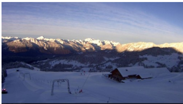
View from Villars this morning, looking west towards the Portes du Soleil

Further east, there is not quite as much snow, particularly in the south-east, where St Moritz (15/110cm) is the only major Swiss resort now slightly below par for the time of year.