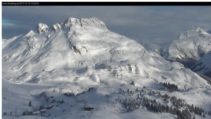
It was cloudy to start with in Austria this morning but the sun is breaking through (this is Lech) - www.skiarlberg.at

Further east in Mayrhofen (45/75cm), there hasn't been as much snow, but at least temperatures have cooled off a little which has allowed the pistes to firm up again.