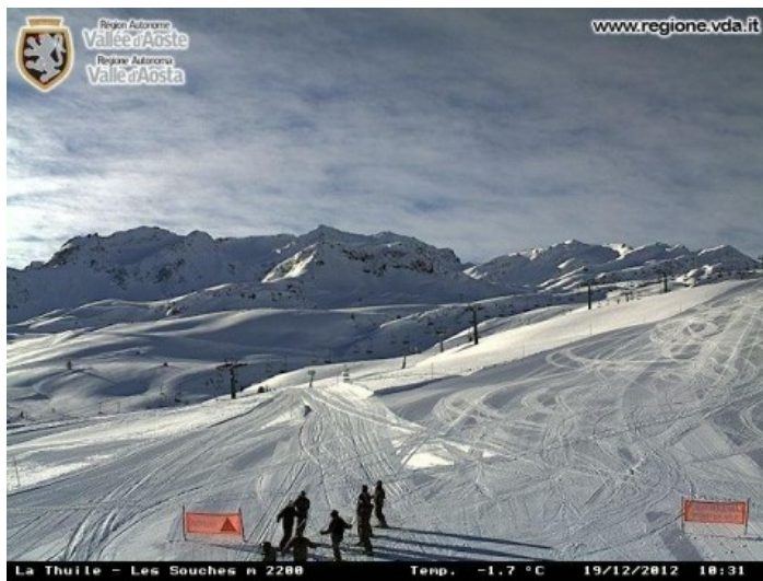
La Thuile is one Italian resort which has had some fresh snow in the last few days - ww.regione.vda.it

Generally speaking, the Italian Alps have not seen much fresh snow in the last couple of days. One exception has been the western Aosta valley where Courmayeur (90/170cm) and La Thuile (60/200cm) can both offer powdery pistes. Further east, snow depths are more modest but conditions in resorts such as Selva Val Gardena (20/70cm) are still perfectly reasonable for the time of year.