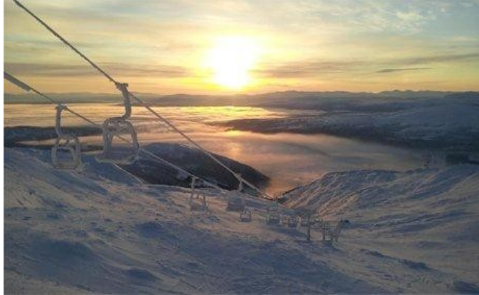
Gorgeous low light at this time of year in Åre, Sweden, but they could do with more snow

There isn't much fresh snow in Andorra either but most lifts are open in Soldeu (40-80cm) and Arinsal (25/50cm) where on-piste, at least, conditions are still very good for the time of year. Bulgaria's season is also well under way with 25/75cm in Bansko and good conditions reported on the upper slopes. Skiing is also still possible in Scotland led by Cairngorm (35/75cm), though high winds may affect lift operations today.