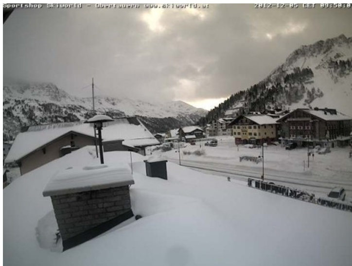
Conditions in Obertauern have greatly improved recently

The build-up to the main season has been steady rather than spectacular in most Austrian resorts. Lech (45/65cm) has had to push back its opening date until tomorrow but now has plenty of snow at all levels. Obertauern (45/75cm) is another resort that looked a bit threadbare until recently but is now vastly improved with at least half of its 26 lifts now open. Glaciers aside, however, the best skiing in Austria right now is in Ischgl (126km of pistes, 85cm upper base) and Obergurgl (80km, 157cm).