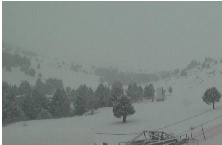
It's snowing in the Pyrenees too. This is Soldeu.

All Andorran resorts are now up and running. There isn't nearly as much snow as in most of the Alps but conditions are still good for the time of year with 60cm on the upper slopes of Arcalis and 30cm above Soldeu . The best skiing in Scandinavia is still in Norway where over half of Hemsedal's 54 pistes are open on a 55cm upper base. It is bitterly cold however, just as it is in Sweden's premier resort, Åre , where only 3 runs are open on a 24cm base. More terrain is promised here soon.