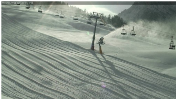
Fabulous early season conditions in Montgenèvre

Not quite as much snow has fallen in other Tarentaise resorts (20-30cm typically) but conditions are excellent in Val Thorens where 20 runs are open and the upper base is now 85cm deep. Les 2 Alpes is the other big name that opens tomorrow. Here too there has been lots of fresh snow and prospects are excellent.