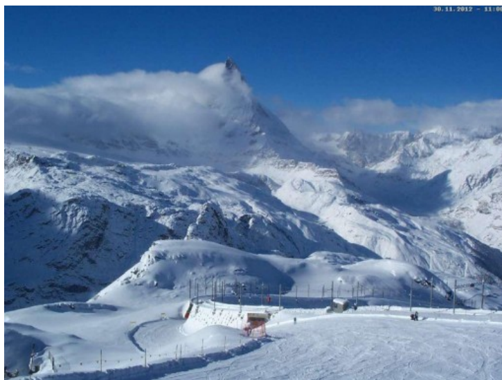
It doesn't get much better than this - www.zermatt.ch

Elsewhere in Switzerland more and more resorts are partially open or opening this weekend including St Moritz , Davos , Engelberg , Verbier , Andermatt and Zinal .