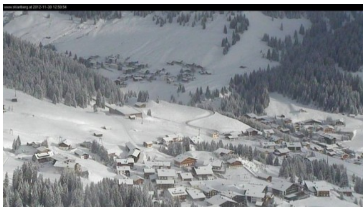
Conditions are improving in Oberlech - www.skierberg.com

Ischgl opened last weekend and still offers the most extensive skiing in Europe with 108km on a 60cm base. They too have fresh snow but not as much as Obergurgl where 60cm has fallen on the upper slopes thanks to its proximity to the Italian border. Here the base is now 125cm deep and 16 lifts are running. Other good options in Austria include Sölden , Stubai and Hintertux .