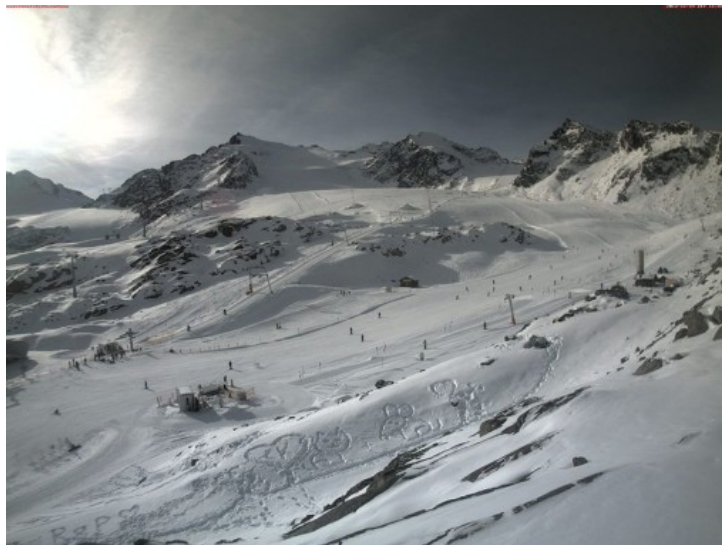
Still good on the Austrian glaciers

Ischgl opens today and currently offers the most extensive skiable terrain in Europe. You can't ski back to resort yet but, higher up, 28 lifts serve 87km of pistes on a 60cm base. Good piste skiing is also available in Obergurgl (15 lifts, 68cm upper snow base) and in Sölden , Hintertux and Stubai all of which have close to a metre on their glaciers. Numerous other glaciers are also open including Pitztal and Kitzsteinhorn , but lots more snow is needed before most of the lower resorts can start getting excited.