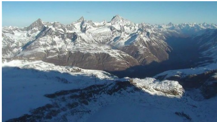
View from top of the Zermatt ski area this morning (Klein Matterhorn) - www.zermatt.ch

Zermatt (12 lifts, 90cm upper base) and Saas-Fee (5 lifts, 145cm) remain the best options in Switzerland. More limited skiing is available in Engelberg , Davos , at Glacier 3000 (near Les Diablerets ), Diavolezza (near St Moritz ) and at weekends only in Verbier , Laax , Zinal and Andermatt .