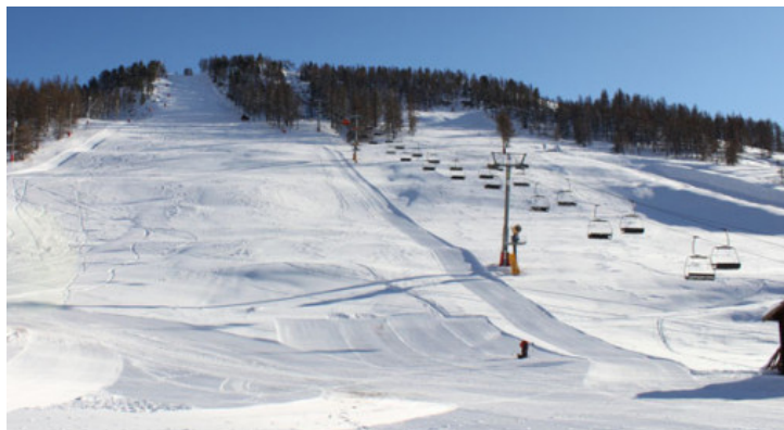
Montgenèvre has more snow than most French resorts

This weekend sees Val Thorens (60cm up top) open some pistes for the first time. Montgenèvre will also offer another pre-season taster before things kick off properly on 1 December. The weather is slowly turning unsettled and there is a chance that winter will return next week.