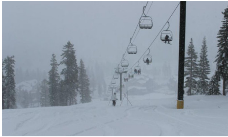
Lots of fresh snow for the Californian resorts - www.kirkwood.com