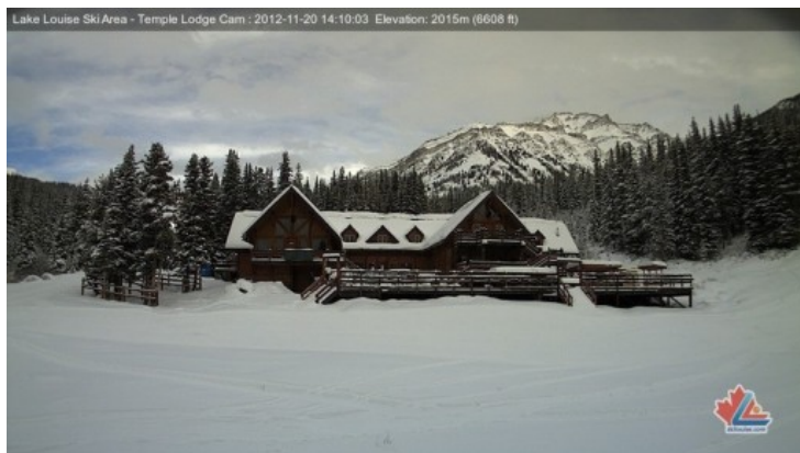
Lots of early snow for Banff/Lake Louise - www.skilouise.com

Lots of snow has been falling in western Canada where Whistler is now offering 6 runs on a mid-mountain base of 86cm. Sun Peaks (3 lifts, 53cm mid-mountain base) also opened last weekend but the best conditions are in Banff/Lake Louise (16 lifts, 83cm snow base).