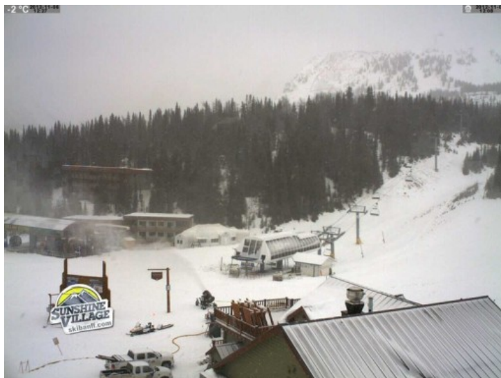
Snowing again in Banff yesterday - www.skibanff.com

Early season conditions are more promising in Canada where Norquay Mountain ( Banff ) managed its earliest ever opening last week – albeit temporarily. Sunshine Village and Lake Louise should open properly this weekend.