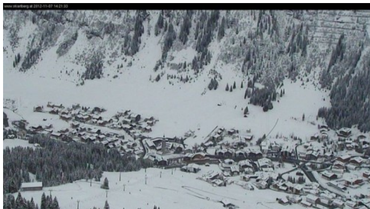
Lech won't open for several weeks, but there is plenty of snow in the village - www.lech-zuers.at

Austria has the best skiing in Europe right now led by Stubai and Sölden which each offer around 60km of pistes – not all of which are confined to the glaciers. Hintertux (50km) is another good option and you can also ski at Mölltal , Pitztal and Kaunertal – albeit in a more limited capacity. Schladming is the only entirely non-glacial resort currently open for business with 6 pistes on the Planai sector.