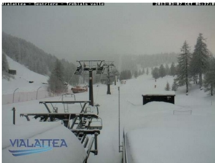
Snowing again in western Italy this morning. This is Sestriere - Photo: www.vialattea.it

Thursday will be mostly cloudy with outbreaks of snow (1400m) in the western Italian Alps. Further east it should start dry, but here too a few showers (snow 1500m) are likely later. Friday will see little change with further showers, most frequent in the west, more scattered in the east with snow above 1400-1800m.