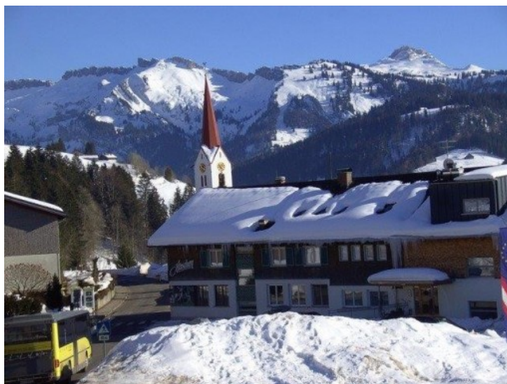
Brighter skies in the Austrian Vorarlberg this morning. This is Sibratsgfaell.

On Saturday , all areas are at risk of some showers with a little snow above 1500m. Further showers are likely on Sunday and, with colder air digging in from the north, some snow is likely to 1000m or lower later in the day.