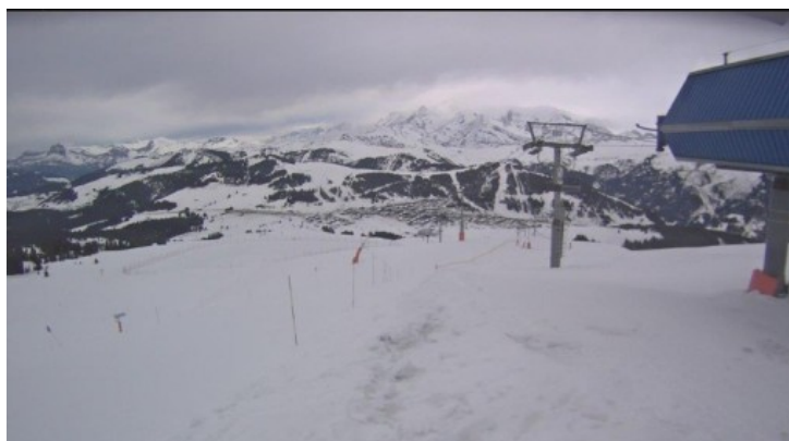
Les Saisies with the Massif de Mt Blanc buried in the clouds in the background