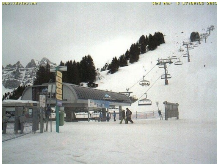
Cloudy on the Swiss side of the Portes du Soleil this morning. This is Champéry