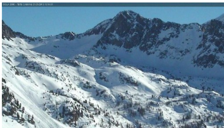
Sunny in Isola 2000 this morning