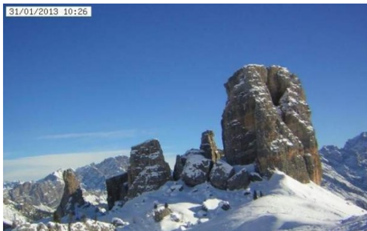
Bluebird day in Cortina

Saturday will be cold with a few snow showers (to low levels) again heaviest in the far north-western Alps, more scattered elsewhere where some sunshine is possible. It will remain cold on Sunday with some sunshine and just the odd snow shower close to the border areas.