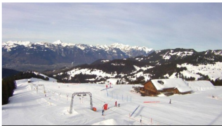
Sunny morning in Villars but cloud is expected to thicken later

Saturday will remain cloudy with showers or longer spells of snow (500m) heaviest in the north and west, lightest in the far south-east where some brighter spells are possible. Except for a few flurries, most places should be drier and brighter on Sunday but it will feel cold with a biting wind at altitude.