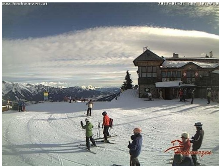
Nice weather in Schladming today

It will turn much colder on Saturday with significant snow (above 600m) for most regions. Sunday will be brighter but very cold with just a few scattered snow showers to low levels in the northern Austrian Alps.