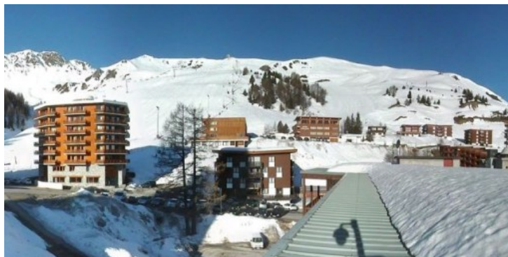
Plenty of snow left in La Plagne, which closes this weekend.