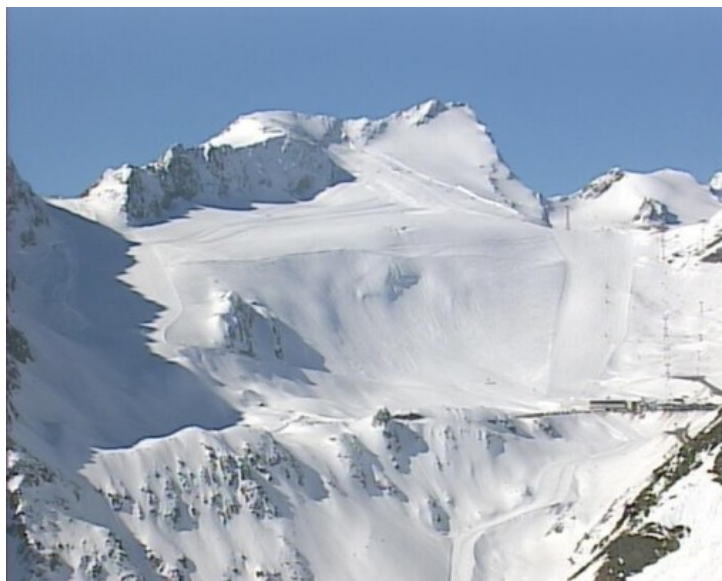
Excellent conditions up on the glaciers above Sölden today.

Saturday will be cloudier with the risk of showers in all parts. A little snow is possible above 2200m, but significant falls are unlikely. Sunday will see one or two light showers lingering in places, but most places will be dry with some cloud but also some sunny spells. Freezing levels will be around 2800m.