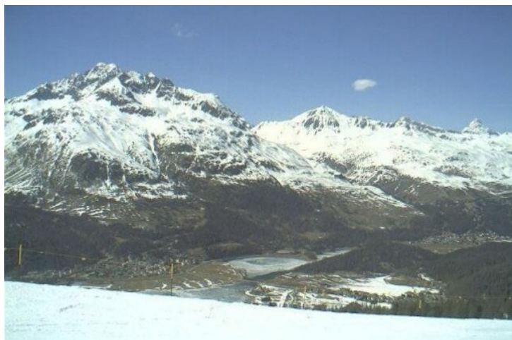
Looking across the Engadin from Corvatsch (St Moritz).

Saturday will be cloudier with showers or longer spells of rain and snow above 1800m. Sunday will remain rather cloudy in places, but any showers (snow 2200m) will become fewer and further between with some sunshine in places.