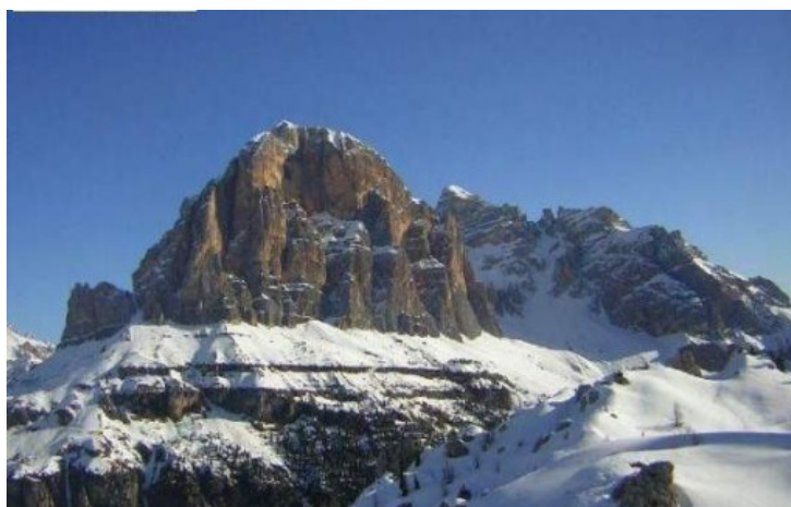
Wall to wall sunshine across the Dolomites today, where Cortina is one of the few resorts to remain open.

Saturday will be mostly cloudy with showers or longer spells of rain/snow (1800m). There will not be much change on Sunday either with some showers (snow 2000m), but perhaps a greater chance of some sunshine too.