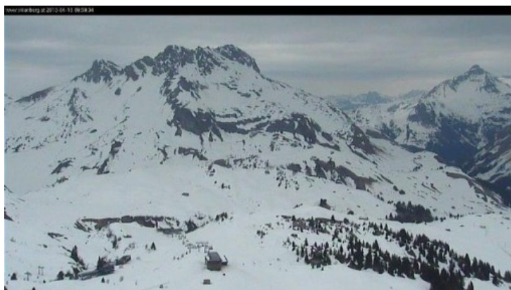
Some cloud in western Austria this morning but this should break up later. This is Lech - Photo: www.ski-ariberg.at

Saturday will be cold and mostly cloudy with showers or longer spells of rain/snow. The snow will be heaviest in the south-western Austrian Alps (e.g. Ischgl, Obergurgl ) and the rain/snow limit will be between 1000m (north) and 1500m (south). Sunday will be brighter with some bright spells and a few residual showers in the south (snow 1800m).