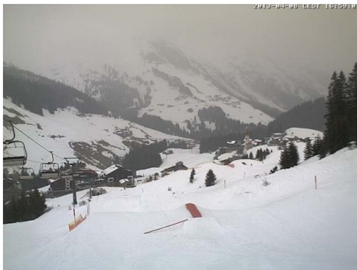
Still looking like winter in Warth-Schröcken - Photo: www.warth-schroecken.at

Thursday will be mostly dry but milder with just the odd shower in the west (snow 1800m). It will remain unsettled on Friday with further showers (snow 1600m) but also some drier brighter spells.