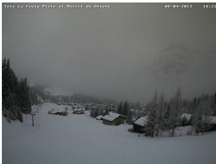
Fresh snow today in south-west Switzerland. This is La Fouly - Photo: www.lafouly.ch

especially in the west and north. The southern Swiss Alps may stay dry until later in the day. It will turn cooler on Friday again with further rain/snow (1400m), heavy at times.