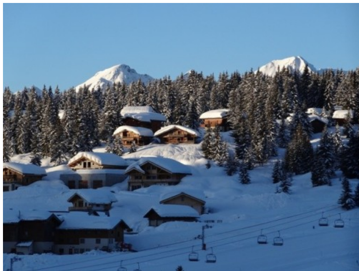
Gloriously sunny today in Les Saisies