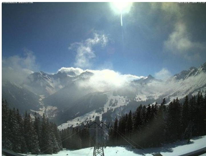
Bright skies over Brand in the Austrian Vorarlberg on Monday afternoon.

There will be little change on Wednesday and Thursday with plenty of sunshine but also some cloud at times with the risk of the odd snow shower (1200m). Friday may be more generally cloudy with the increased threat of showers. However, no significant snow is expected at this stage.