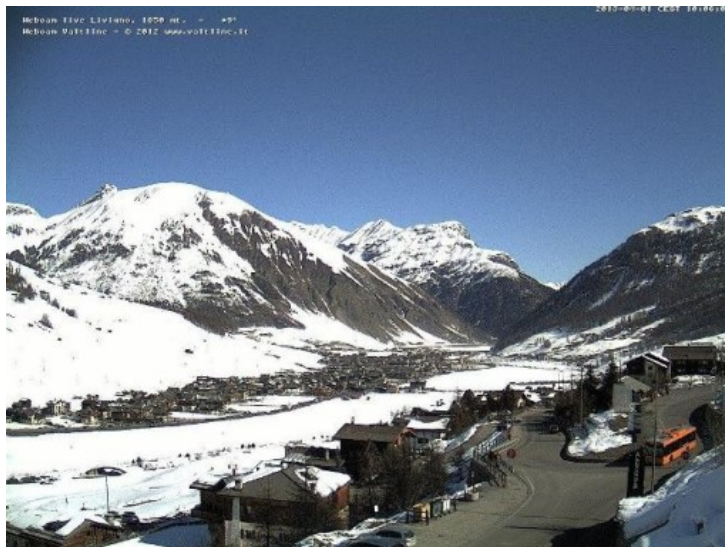
Clear skies over Livigno on Monday but some snow is expected later in the week

Thursday may be cloudier at times, particularly in the central (Lombardy) and eastern (Dolomites) Alps where some snow showers (1200m) are possible at times. Friday is also expected to be unsettled with the chance of snow showers (1200-1400m) almost anywhere.