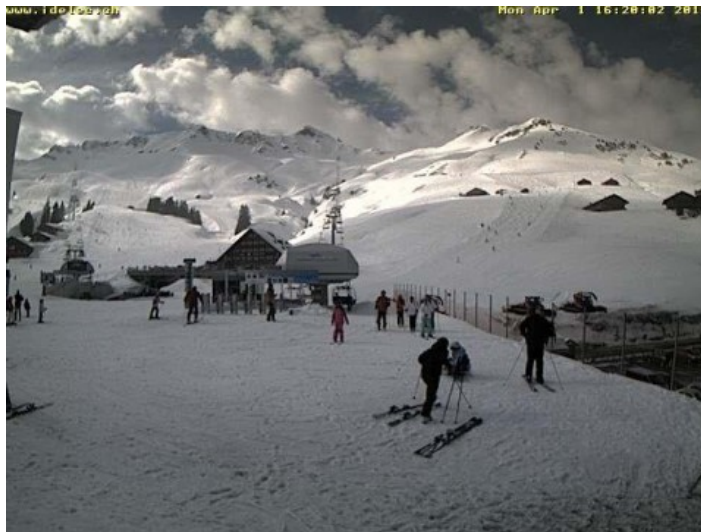
A little afternoon cloud over the Swiss Portes du Soleil where plenty of sunshine is expected this week - Photo: www.idelec.ch

Remaining cool (cold even for the time of year) with further snow showers in places.