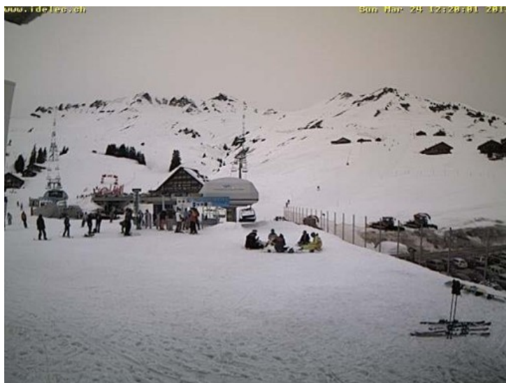
Cloudy but mostly dry across western Switzerland today. This is Champéry in the Portes du Soleil - Photo: www.idelec.ch

The odd snow flurry is still possible on Wednesday , but many places will be dry and bright, though still rather cold. On Thursday it should remain dry and bright in the north and east, but cloud will increase in the south-west later with snow showers possible later in the day.