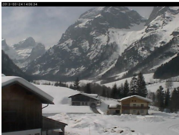
Still reasonably bright in the far north of the Austrian Alps today (Sunday). This is Lungötz near Salzburg.

Wednesday will remain cold, but any snow flurries will become lighter and more scattered again with some sunny spells appearing, especially in the north. Thursday should be mostly dry with good sunny spells and milder temperatures.