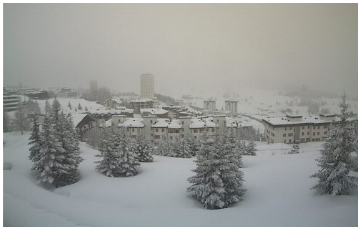
Snowing today in much of the Italian Alps. This is Sestriere

On Wednesday any snow flurries should become light again with the best of any brightness in the west. On Thursday the situation will be reversed with snow showers likely in the west and the driest, brightest weather further east.