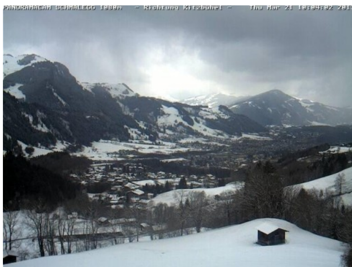
Cloudy with a few snow showers over Kitzbühel this morning - Photo: www.kitz.net

Saturday should also remain dry and mostly bright, but thicker cloud may creep into the far south later with the chance of the odd shower (snow 1400m) close to the Italian border. These showers may become a little more widespread on Sunday , particularly in the far south-east, with the rain/snow limit lowering towards 1000m. However, most of the Austrian Alps will remain dry with sunny spells.