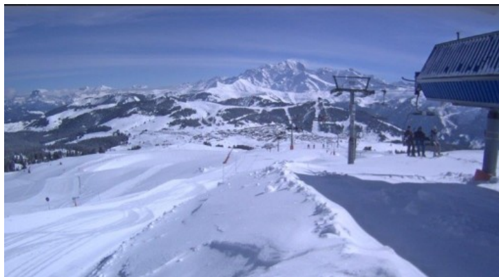
Perfect conditions in the northern French Alps this morning. This is Les Saisies.