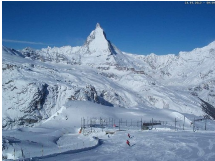
Perfect weather and perfect pistes in Zermatt - Photo: www.zermatt.ch