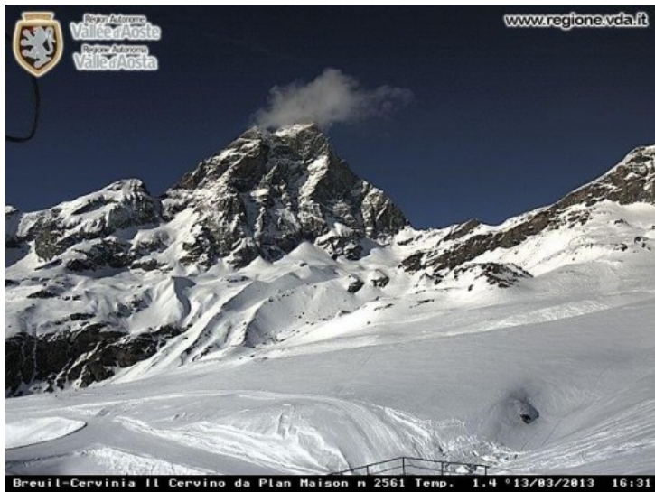
Breuil-Cervinia Il Cervino da Plan Maison n 2561 Temp. 1.4 °13/03/2013 16:31 Stunning weather in Cervinia on Wednesday evening with more to come this week (though it will be cold) - Photo: www.cervinia.it

Saturday should start dry and bright – and remain so in the eastern Alps – but cloud will quickly increase in western areas later with some snow (above 600-800m) later. Sunday is likely to be cloudy in all areas with showers or longer spells of snow (above 600-1000m) with some significant accumulations in places.