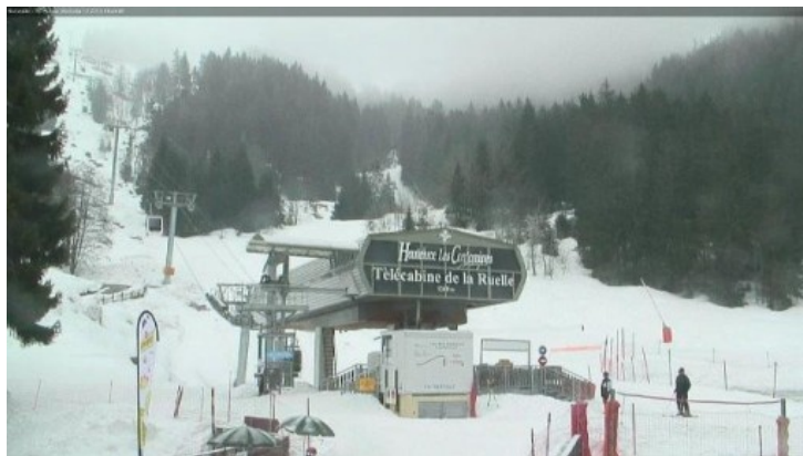
Cold and rather cloudy conditions across much of the French Alps right now. It will soon brighten up, however. This is Hauteluce near Les Contamines.