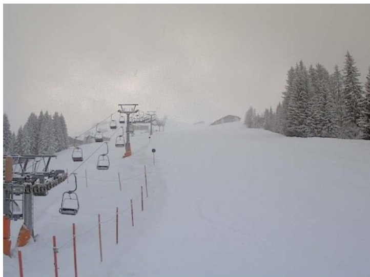
Fresh snow in many Austrian resorts right now. This is Damüls.

Saturday will be mostly fine with long sunny spells and milder temperatures. On Sunday , the Foehn wind will make it milder still, particularly in the north and west. Most places should stay dry but it will be rather cloudy at times, especially in the south. The best of any sunshine will be in the north-east.