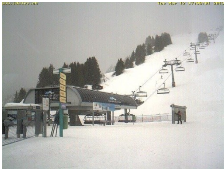
Flat light in the Swiss Portes du Soleil yesterday evening. This is Champéry - Photo: www.idelec.ch