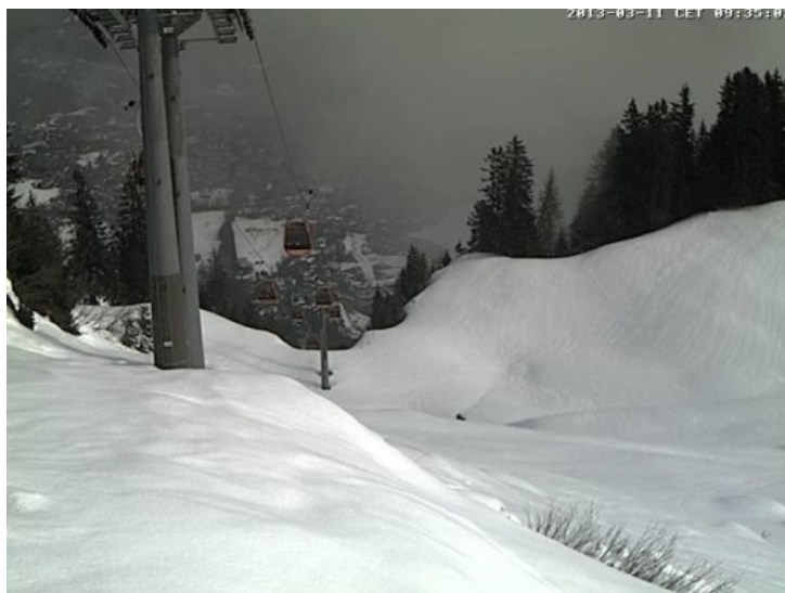
Rather cloudy in Kitzbuhel this morning with the chance of some showers later (snow above 1200m)

Wednesday will see more widespread snow (600-800m) with some significant falls in places. It will turn colder still on Thursday with further flurries to all levels.