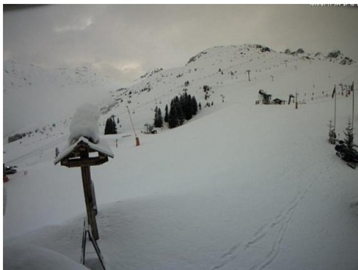
A little fresh snow for the French Tarentaise. This is Champagny en Vanoise.