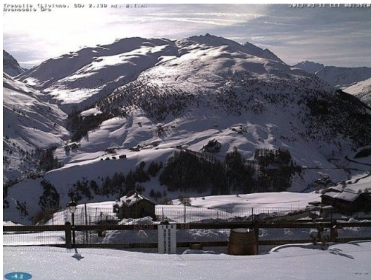
Bright in Livigno this morning but some cloud is expected to build later

Wednesday will see more widespread snow (800m), particularly in the eastern Italian Alps with more scattered flurries further west. It will feel bitterly cold by Thursday with further flurries to low levels in places, but also some brightness, particularly in the west.