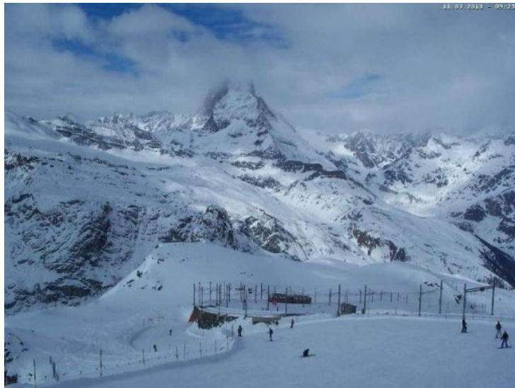
Plenty of cloud over the Zermatt area this morning