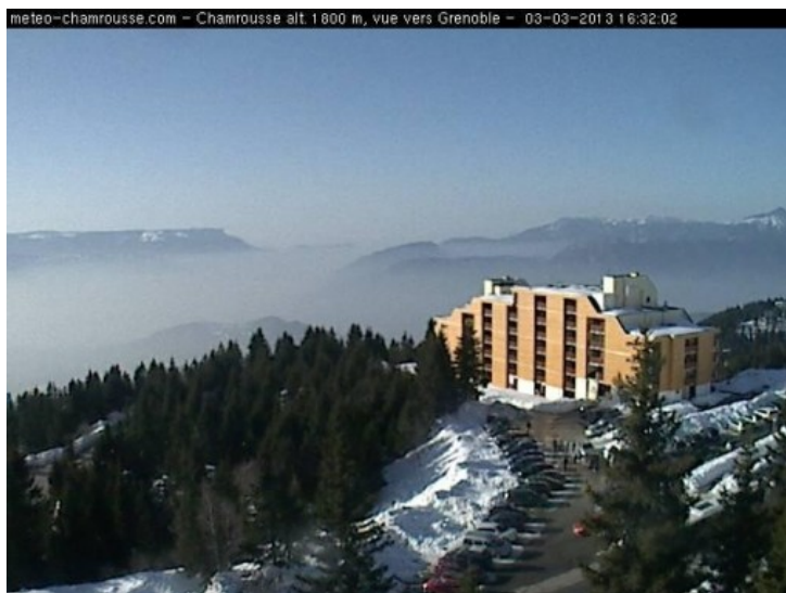
Chamrousse above the pollution haze of nearby Grenoble