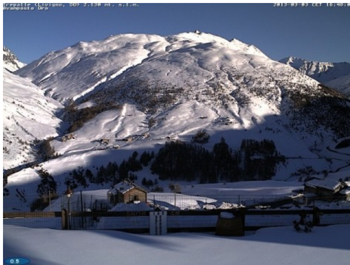
Bluebird in Livigno today

Wednesday will be the worst weather day of the week with showers or longer spells of rain/snow (above 1000-1500m) heaviest in the west. Showers (some snow above 1400m) should be less frequent on Thursday , but most places will remain rather cloudy.