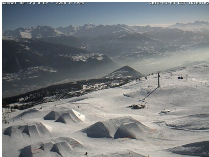
Fantastic weather in Crans Montana today, as everywhere in the Alps