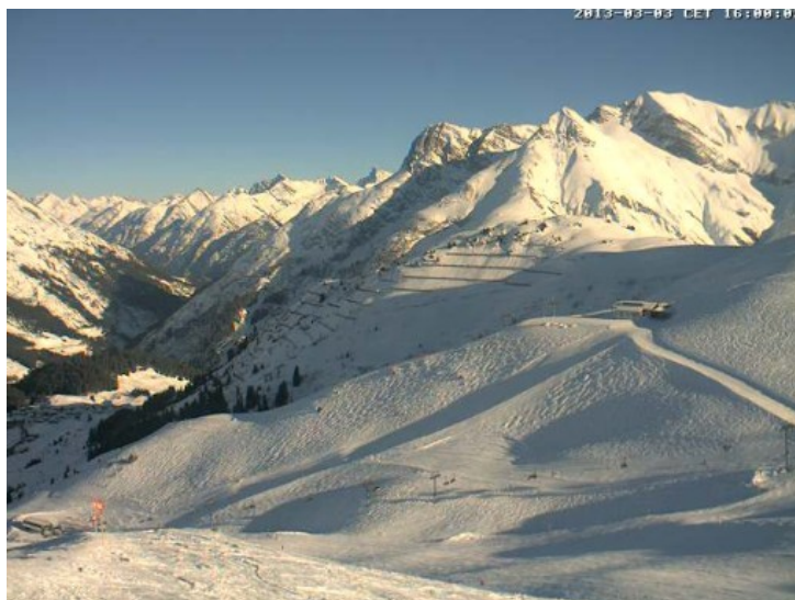
Sunny skies and mild temperatures on Sunday afternoon in Warth-Schröcken

On Wednesday , it will be cloudier in the far south, with one or two showers (snow above 1600m) possible close to the Italian border. All other regions will be dry with variable amounts of sunshine. The Foehn wind will continue to affect some regions, particularly the north and west. Thursday will see showers (snow above 1400-1600m) become a little more widespread in the south and east of the Austrian Alps, but no significant rain or snow is expected.