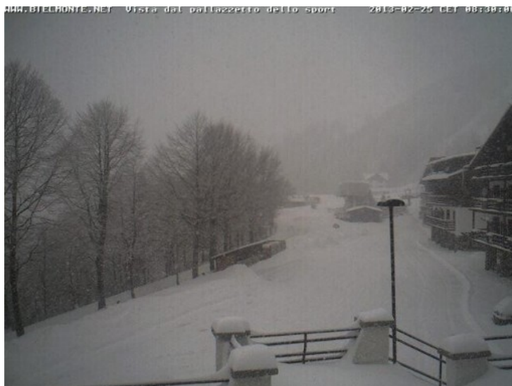
Fresh snow today in the western Italian Alps. This is Biemonte near Milan

By Wednesday and Thursday it should begin to turn a little milder, but snow flurries are still likely here and there, with some sunshine in between.