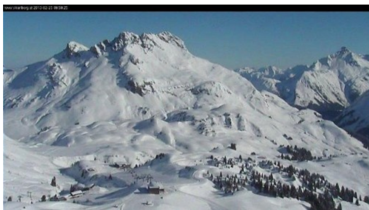
Gorgeous morning in western Austria. This is Lech

Today ( Monday ) will be cold but mostly dry with plenty of sunshine and just a few snow flurries in the far eastern Alps. Tuesday will be generally cloudier with a higher chance of snow flurries almost anywhere, but still heaviest in the eastern Austrian Alps. The far western Tirol ( St Anton ) and Vorarlberg areas should be drier and brighter, but it will remain relatively cold.