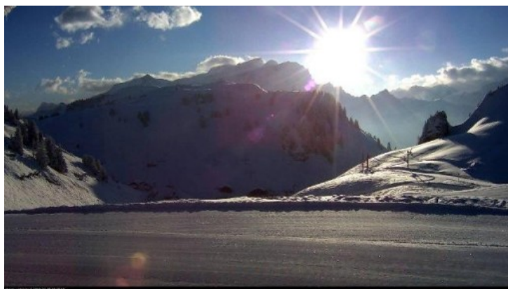
Bright start over Western Switzerland this morning. This is Villars

On Wednesday and Thursday it should be dry and bright just about everywhere, and feeling a bit milder too.