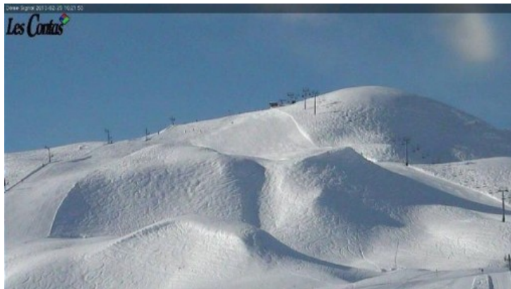
Blues skies across most of the northern French Alps this morning. This is Les Contamines - Photo: www.lescontamines.com

There will be little change on Wednesday and Thursday except that temperatures will begin to rise and it will feel noticeably milder.