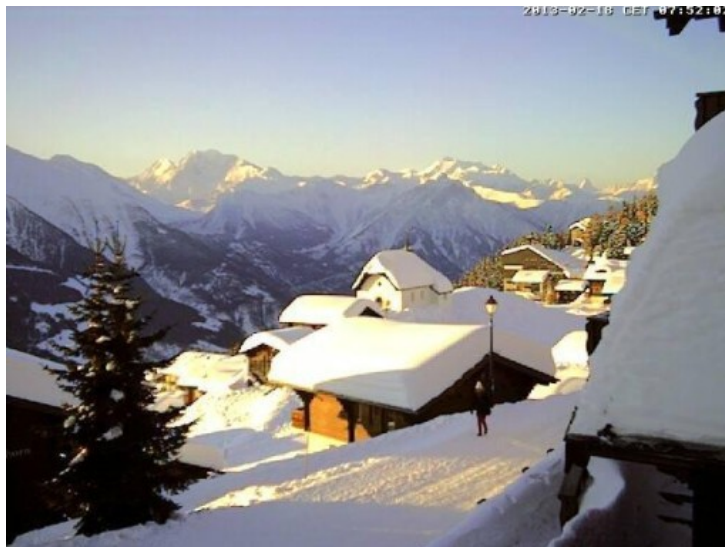
Gorgeous day across the Swiss Alps. This is Bettmeralp

Further light snow flurries are likely in the east on Wednesday morning, dying out later. Plenty of sunshine is expected to continue further west. Thursday is likely to be mostly dry with just an isolated snow flurry here and there. It will turn colder though with a strengthening easterly breeze.