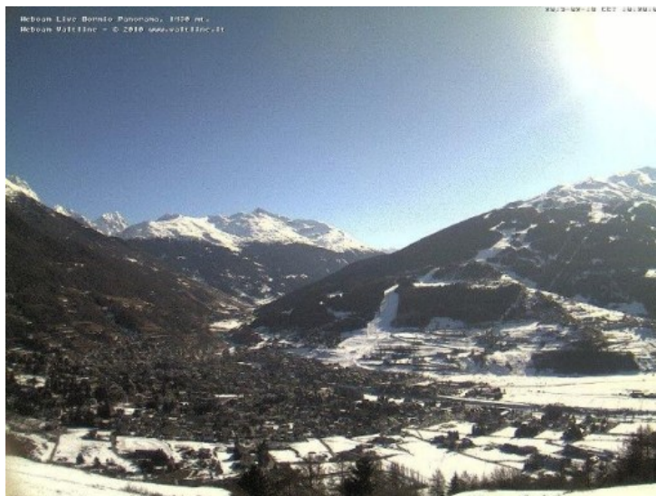
Perfect weather in the Italian Alps today. This is Bormio

It will turn colder again on Wednesday and Thursday with an increasing chance of snow flurries (to low levels), especially in the east. There will also be some sunshine, however, and some places will stay dry.