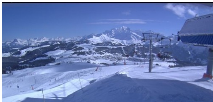
Mont Blanc viewed from Les Saisies - Photo: www.lessaisies.com

Thursday should also remain dry but the easterly wind will start to strengthen and the temperature will start to drop.