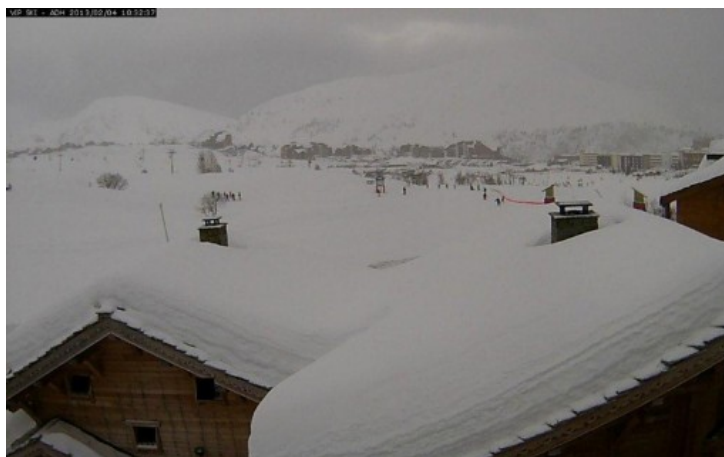
Cloudy with light snow in Alpe d'Huez this morning