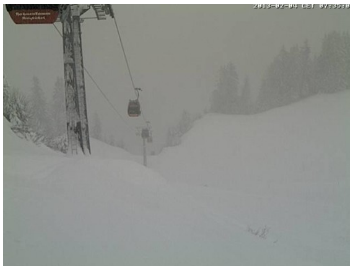
Heavy snow in Kitzbühel this morning - Photo: www.kitz.net

Wednesday and Thursday will be mostly cloudy with further snow showers in places (400m) but also some spells of sunshine.