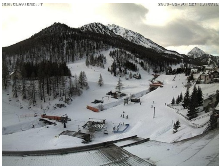
Brighter this morning on the southern side of the Alps

It will turn colder on Wednesday and Thursday with further snow flurries possible close to the border areas and the best of any sunshine close to the southern foothills.