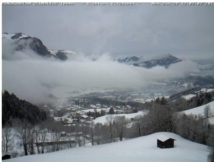
It has been snowing in Kitzbühel this morning but it will turn milder tomorrow with the threat of rain

It will remain very mild on Wednesday with the best of any brightness again in the south. Further north it will be cloudier with a few showers (snow only above 1800-2000m). It should be dry and bright (but still mild) everywhere on Thursday .