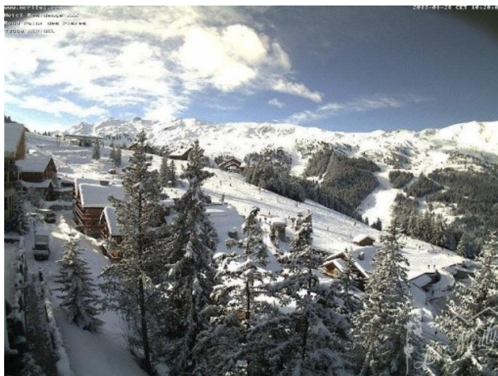
Fresh snow and sunshine in Méribel today - Photo: www.merilys.com