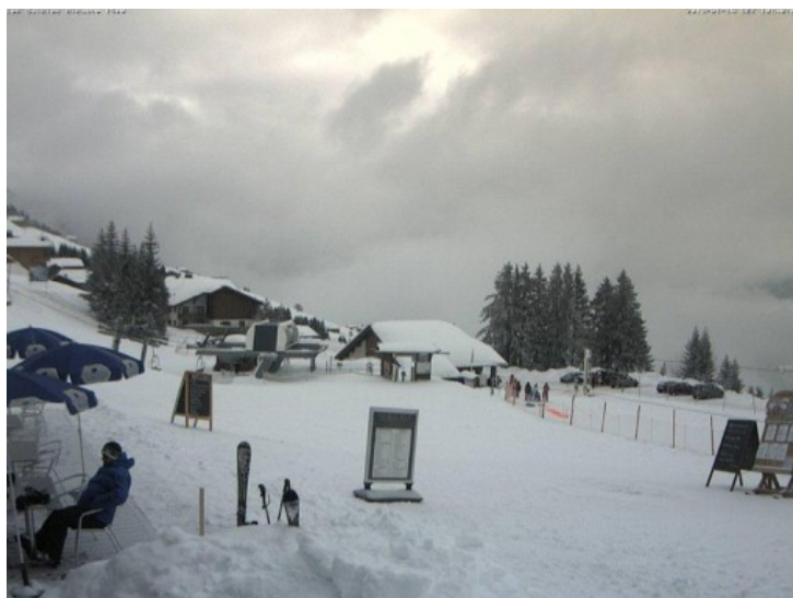
A bit cloudy in Les Saisies this morning but the sun may break through later