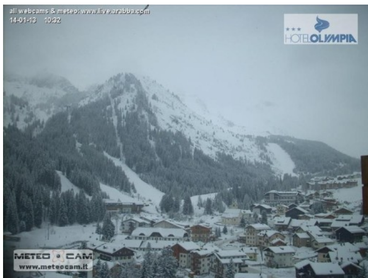
Snowing in the eastern Dolomites this morning. This is Arabba - Photo: www.live.arabba.com

Tuesday and Wednesday will see further snow in the eastern resorts, heavy at times. Further west it will be brighter at times, but some light snow flurries are also likely, especially close to the French border regions. It will remain cold everywhere. Thursday should become dry in the west, but further flurries may continue further east, especially close to the Austrian border.