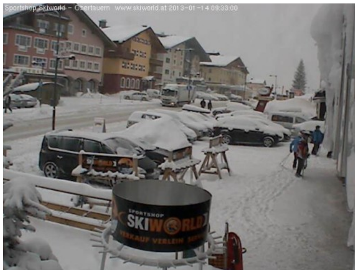
Fresh snow today in Obertauern

It will remain mostly cold and cloudy on Tuesday with a little snow in places, heaviest in the far south close to the Italian border. Wednesday and Thursday will see more general snowfall at all levels, still heaviest in the south and east.