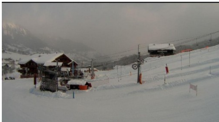
Sun trying to break through the cloud here in Flumet (near Megève).