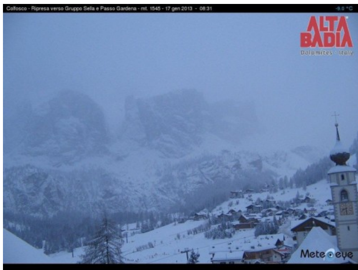
Further snow showers in Alta Badia

Saturday will see snow to low levels returning to the western Italian Alps. Further east it should be dry at first, but a few flurries should reach here as well later in the day. All areas are likely to see further snow on Sunday , heaviest in the western Italian Alps.