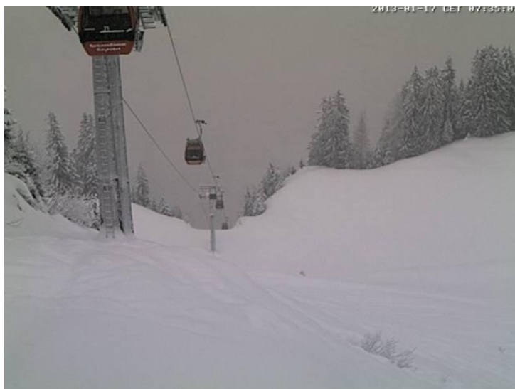
Further snow showers today in Austria. This is Kitzbühel

Tomorrow ( Friday ) will remain bitterly cold, but it should brighten up, with plenty of sunshine in the western Austrian Alps. Further east it may remain cloudier with a few flurries at first. Saturday should be dry with spells of sunshine for all parts but remaining cold. It will turn a bit milder on Sunday with the chance of some showers (snow above 1000-1300m) moving in from the south.