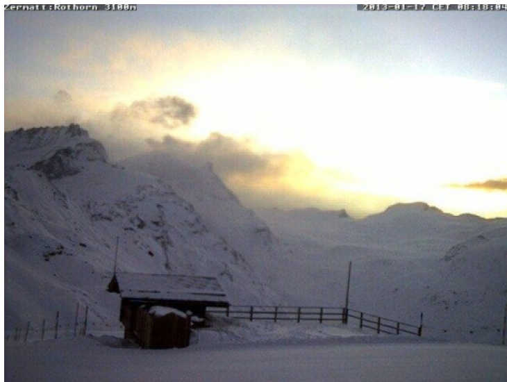
Bright in some western valleys this morning. This is Zermatt - Photo: www.zermatt.ch

Staying cold with further snow at times.