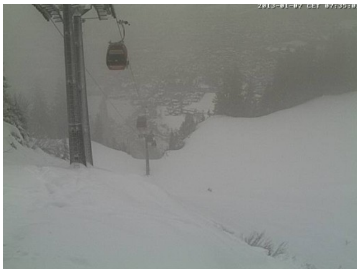
Still a few snow showers at altitude in Kitzbühel (Eastern Tirol) today