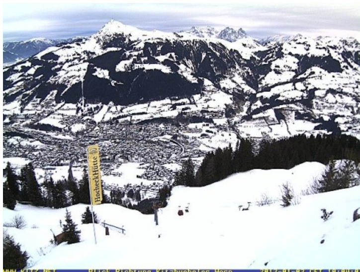
Still plenty of cloud across Austria today. This is Kitzbühel - www.kitz.net

On Saturday the showers should die out again in the western Austrian Alps, but remain frequent further east with further snow above 1000m. On Sunday the last of the showers (800m) should die away from the east and most places should see some sunshine.