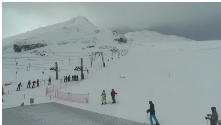
A bit cloudy in eastern Switzerland today - www.laax.com

Today (Thursday) will be mostly dry with some sunshine, but cloud may plague the northern foothills and valleys – and thicken up more generally across the north-eastern Swiss Alps later. Friday will be mostly cloudy in the eastern Swiss Alps with a few showers (snow 1400m), but will probably brighten up later. Other areas should be dry and mostly bright or sunny all day. Saturday and Sunday should be fine just about everywhere, with relatively mild temperatures, particularly at altitude.