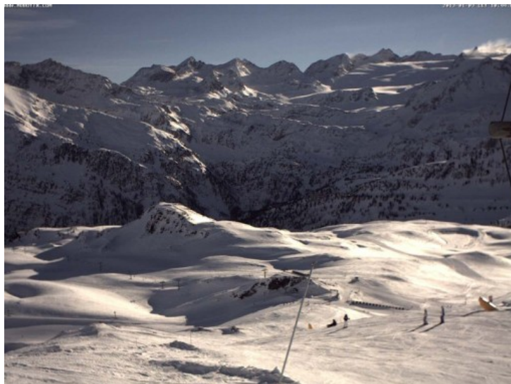
Perfect weather in the western Italian resorts (including La Thuile, pictured) today

The weather will change very little between today ( Thursday ), and Sunday . Most areas will be dry, bright with lots of sunshine and mild temperatures. The best of the sunshine will be in the western Italian Alps. Further east there may be a little more cloud at times, with just the chance of the odd shower (snow 1400m) in the northern Dolomites on Friday and Saturday .