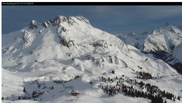
Beautiful day in Lech, but some snow is expected tomorrow night - www.skiarlb.org.at

Wednesday will be cold with snow showers to low levels early in the day, dying out later. Most areas will then enjoy some afternoon sunshine. Thursday should be mostly dry but more snow is expected on Friday.