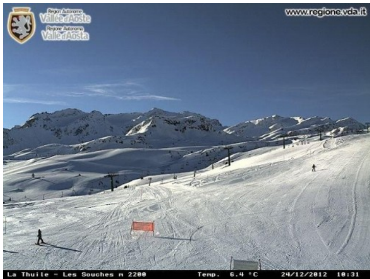
La Thuile (Aosta Valley) this morning

Thursday should be drier in the east but further snow (1000-1300m) is expected in the far west, especially in the Aosta valley close to the French border. It will become drier, brighter and milder everywhere on Friday .