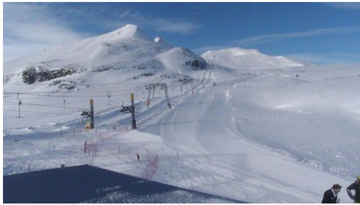
This is the Vorab glacier above Laax today (Christmas Eve)

Saturday looks mostly dry and quite mild with plenty of sunshine, but further weather fronts will approach the northern and western Alps on Sunday .