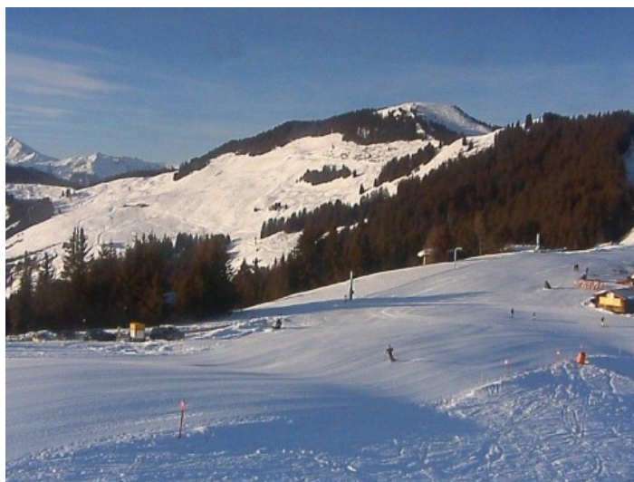
Lovely day in Austria today (including Wildschönau, pictured), but the Foehn is blowing and it is unusually warm - www.viewbitto.com

Wednesday (Boxing Day) and Thursday will be cloudier with showers or longer spells of snow (above 800-1200m) heaviest in the western Tirol and Vorarlberg ( Lech, St Anton, Ischgl, Obergurgl ). Further snow showers (800m) are likely at first on Friday , dying out later.