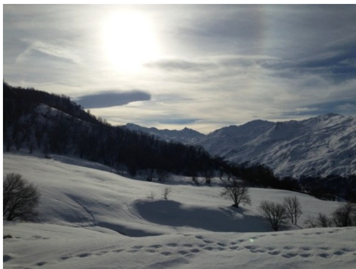
Bright but mild in the Belleville valley today