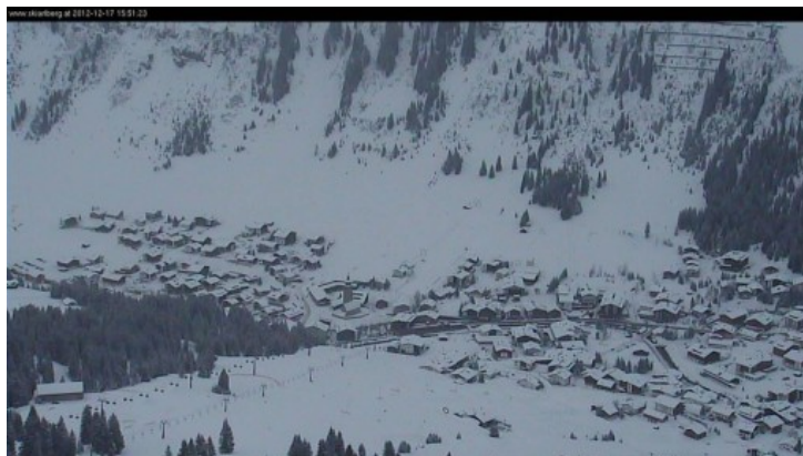
The Vorarlberg is one of the few parts of Austria likely to see any significant snow early this week - www.skiarlb.org.at

A few more flurries are possible to low levels almost anywhere on Wednesday , but no significant snow is expected and some places will stay dry. Thursday is likely to start bright, but cloud will thicken from the west later, with bad weather forecast again on Friday .