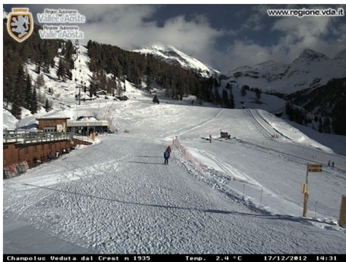
Bright skies over Champoluc today (Monday) as with many Italian resorts - www.regione.vda.it

By Wednesday everywhere should be dry with lots of sunshine. Thursday will remain dry and bright in the eastern Italian Alps, but cloud will thicken up later in the west with some snow likely above 1000m. Friday will be generally much more unsettled with the risk of showers or longer spells of snow (700-1200m).