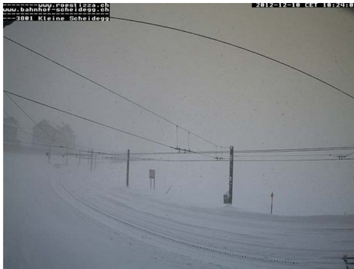
Heavy snow today at Kleine Scheidegg above Wengen