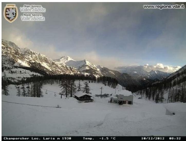
Bright today in the southern Alps where a northerly Foehn effect is in place - www.regione.vda.it

Some snow flurries are likely close to the border areas today ( Monday ), but most Italian resorts will be cold, dry and bright with the best of any sunshine furthest south. Similar weather is forecast on Tuesday , but with more sunshine and colder temperatures. Wednesday is expected to be sunny but cold in all regions before cloud increases from the south-west on Thursday when temperatures will start to rise.