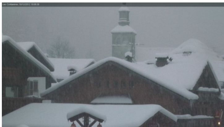
In France, snow is largely confined to the northern Alps again today. This is Les Contamines - www.lescontamines.com