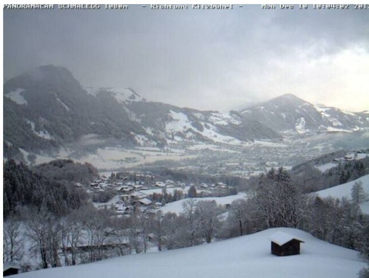
Further snow showers will add to the snow cover over Kitzbühel early this week

Most of the Austrian Alps will be cold and cloudy today ( Monday ) with snow to all levels, heaviest and most persistent in the north and west where 20-40cm is possible. The far south (Carinthia) will see little if any snow. Not much will change on Tuesday except that it will turn colder still with further snow showers, heaviest in the north and west. It will remain bitterly cold on Wednesday but skies should brighten up with sunny spells for most. It will remain bright and cold on Thursday though temperatures will begin to recover a fraction.