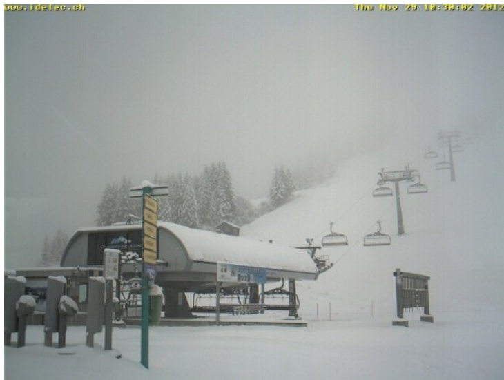
Les Crosets - there's about 30cm of fresh snow at altitude in the Portes du Soleil - www.idelec.ch