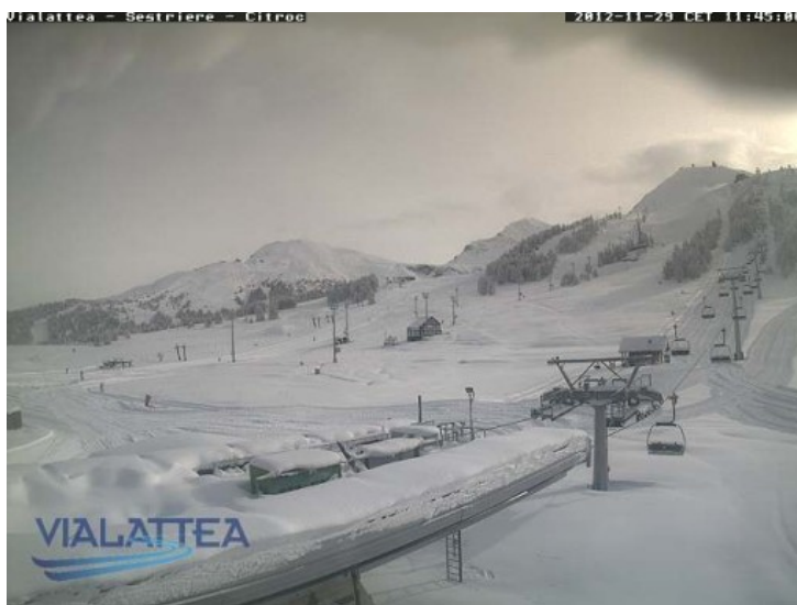
Brightening up today over western Italy. Epic conditions expected in Sestriere for its opening on Saturday - www.vialattea.it

The snow will slowly die out from the western Italian Alps today but will persist further east (Dolomites). Friday will see further flurries in the east but much brighter skies further west. It will remain cold. Saturday should see plenty of sunshine for all parts despite low temperatures. Cloud will move back into the western Alps on Sunday with largely sunny conditions further east.