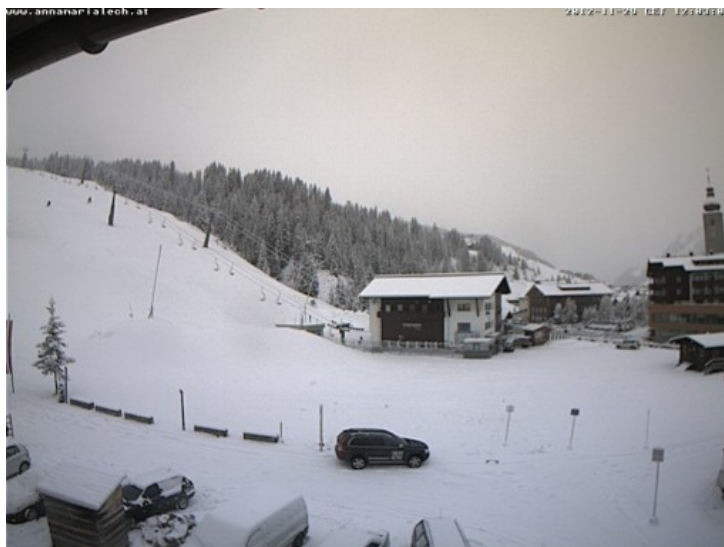
Snow has reached Austria at last - www.lech-zuers.at

Western Austria will see plenty of snow today (to low levels) with snow showers spreading further east as the day goes on. Friday will continue mostly cold and cloudy with light flurries in places. Saturday should brighten up a bit, but it will stay cold and more snow is possible in the west late on Sunday .