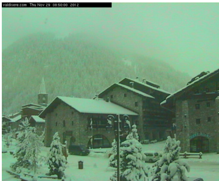
Heavy overnight snow in Val d'Isère. More due on Sunday - www.valdisere.com