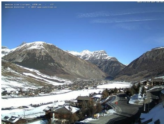
Bluebird day in Livigno today. But it's cloudier further east in the Dolomites - www.livigno.it

again further west. It will be cooler and cloudier on Thursday with the chance of a few showers and a dusting of snow at altitude.