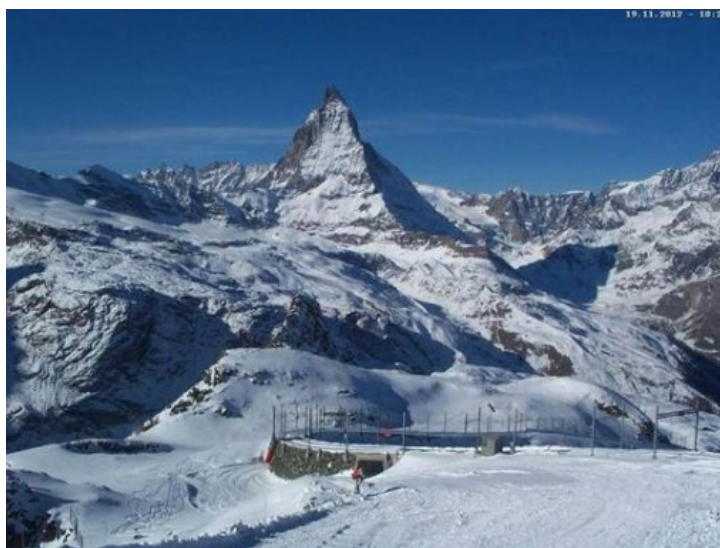
Perfect weather at altitude in Switzerland today

Today will be dry and mostly sunny with freezing levels around 2700m. There will be little change in the weather on Tuesday and Wednesday morning though it may cloud over from the west later. Thursday will be cloudier with the risk of a few showers and a little snow possible at altitude.