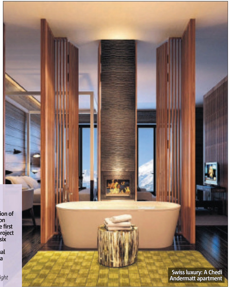
Swiss luxury: A Chedi Andermatt apartment

Doubles from £560 per night including breakfast. www.thechedi-andermatt.com