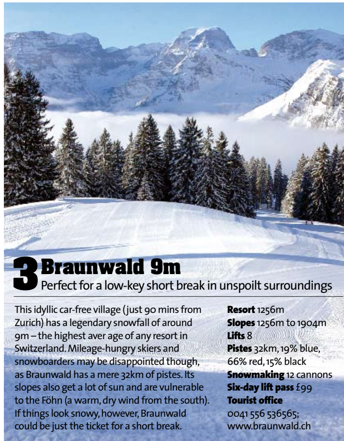
TOURISVERBAND OBERTAERN, BRAUNWALD-KLAUSENPASS, TOURISMUS

Resort 1256m Slopes 1256m to 1904m Lifts 8 Pistes 32km, 19% blue, 66% red, 15% black Snowmaking 12 cannons Six-day lift pass £99 Tourist office 0041 556 536565; www.braunwald.ch